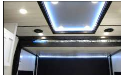
Deluxe Accent Lights w/Soffit