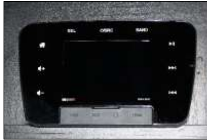
FM/AM Bluetooth® Audio Controls