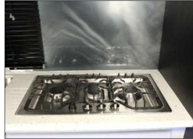
3-Burner Cooktop w/Designer Acrylic Backsplash