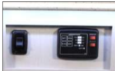
Convenience Center At Galley