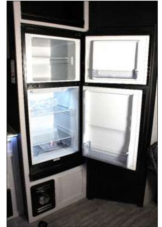
8 Cu. Ft. Double-Door Refrigerator