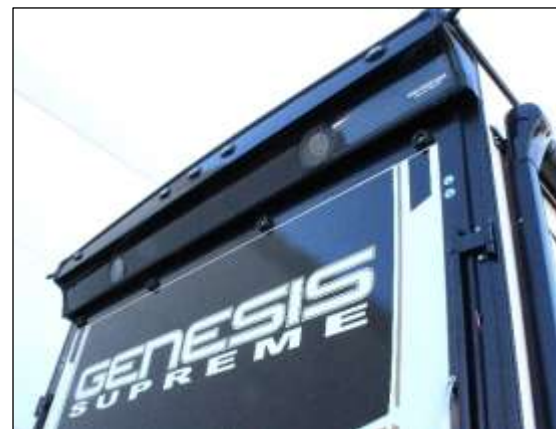
LED Ramp Lights