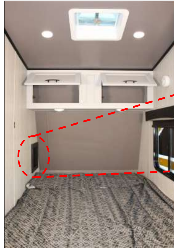
Overhead Storage/Overhead Lighting Bedside Storage w/AC Outlet & USB