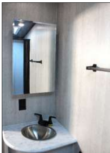
Stainless Lavy Sink