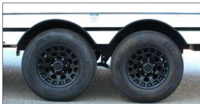
15" Black RaceLine® Wheels/Load Range E Tires