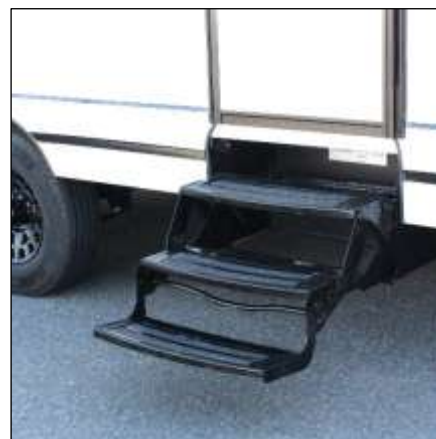
Triple, Radius Entry Step