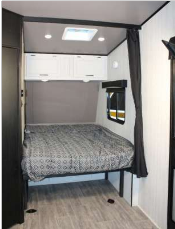
54" X 74" Full-Size Mattress & Bedspread Overhead Vent & Privacy Curtain