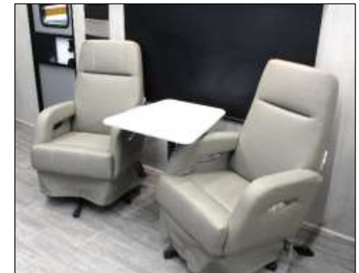
Two Swivel Rockers w/Table