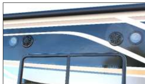
Exterior Stereo Speakers