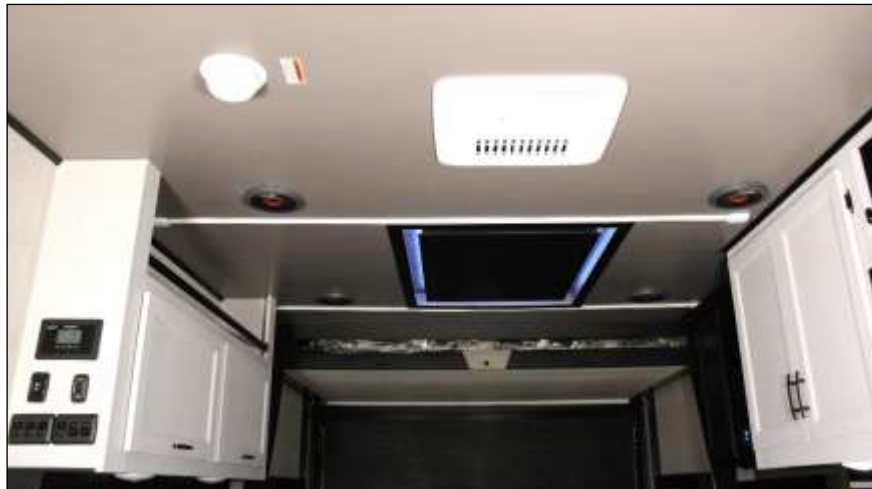
Ceiling-Mounted Stereo Speakers