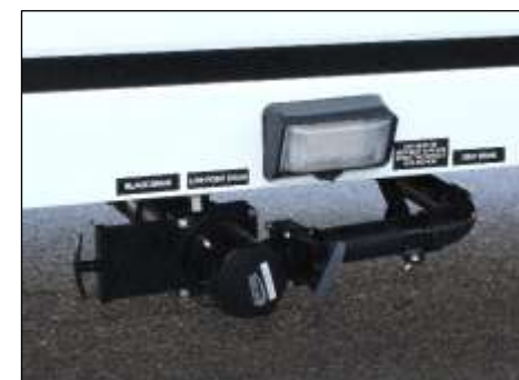
Convenient Dump Valve Light