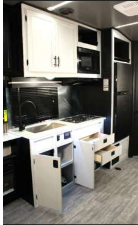
Generous Galley Storage