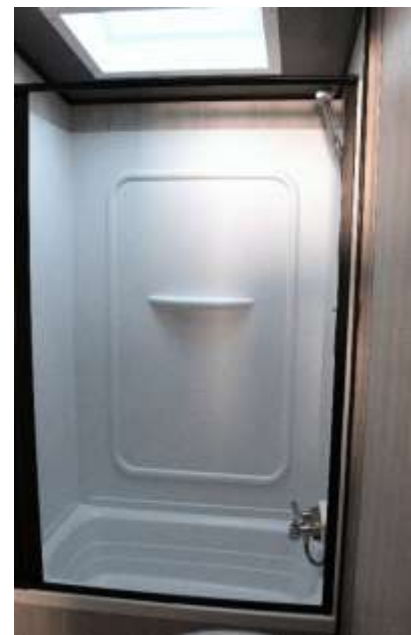
Tub w/Shower Surround Retractable Shower Door Overhead Vent & Skylight