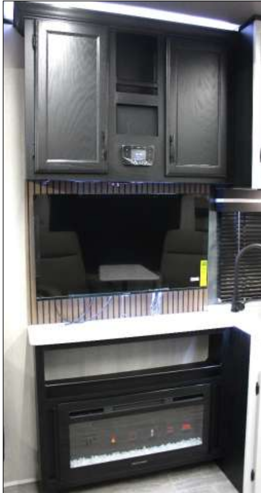
40" TV/Entertainment Center & Fireplace