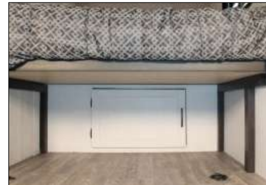
Front Exterior Storage Compartment Accessible from Under Flip-Up Bed