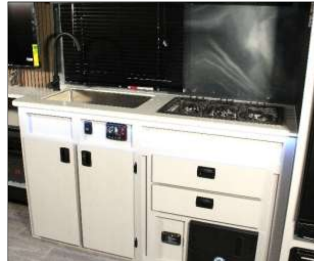
Stainless Galley Sink w/Single Handle Faucet