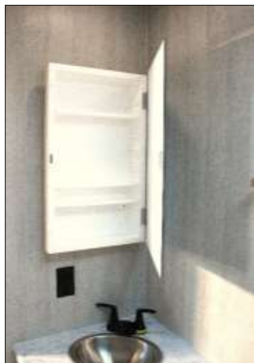
Mirrored Medicine Cabinet