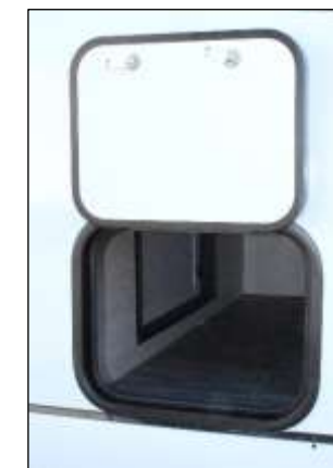
Exterior Storage w/Under-Bed Storage Access