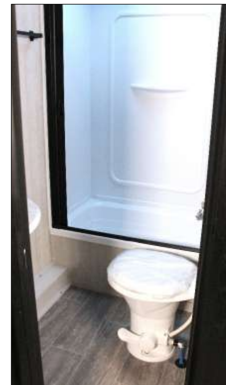
Marine Style Toilet