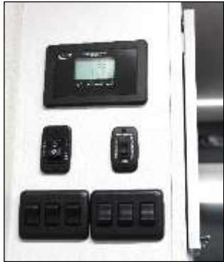
Convenient Lighting, Awning, Bed Lift & Solar Controls