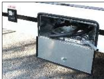
Optional 40-Gallon Fuel Station