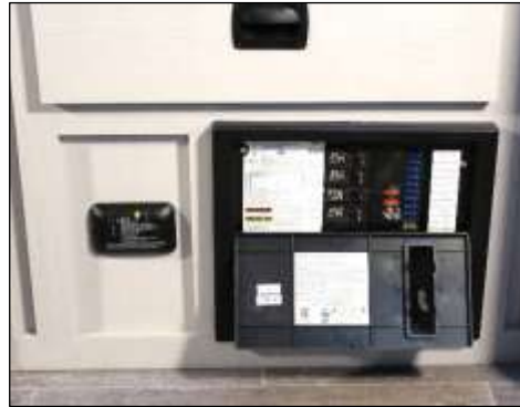
Easy-Access 12-Volt Fuse & 120-Volt Breaker Panel