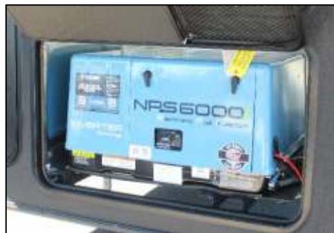
Optional Yamaha 6.0KW Generator