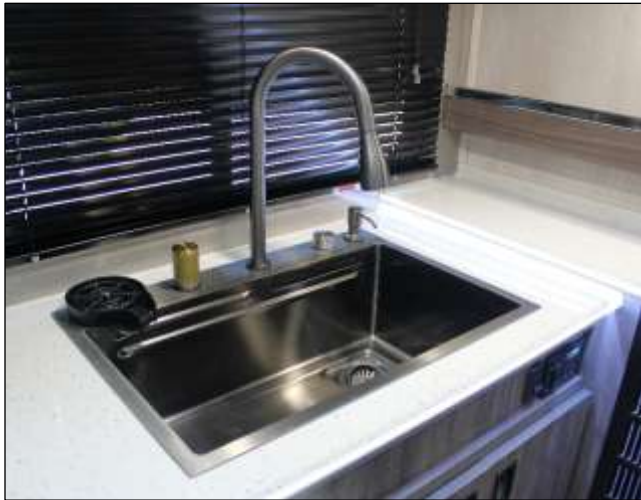
Waterfall Sink w/Accessories