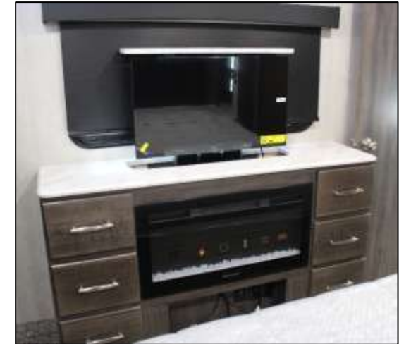
32" HideAway TV / 30" Fireplace