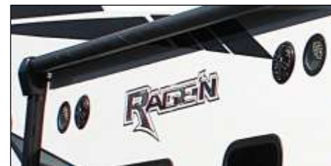
Exterior Audio/Security Lights