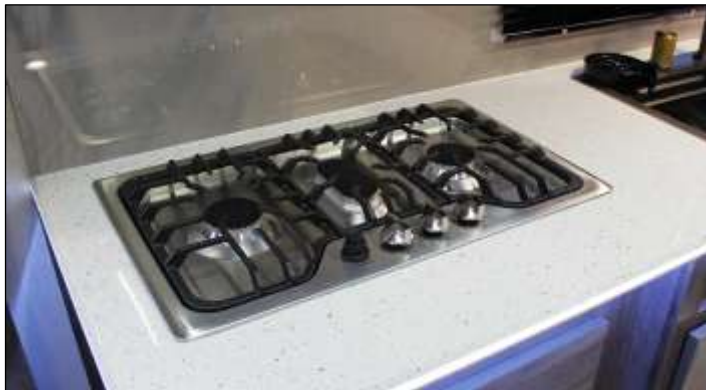
3-Burner Cooktop/ Designer Acrylic Backsplash