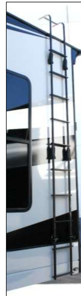
Exterior Folding Ladder & Walk-On Roof