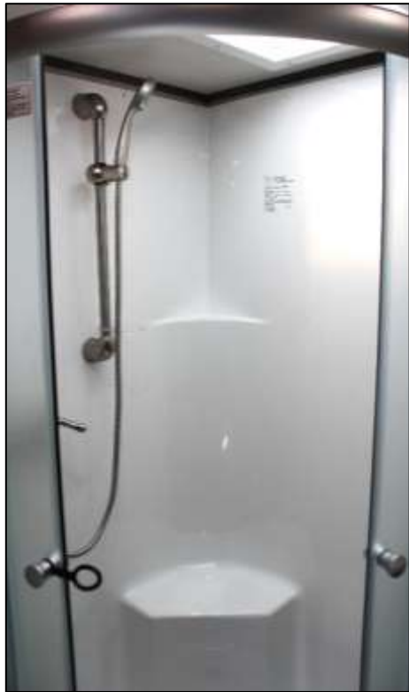
Large Shower w/Curved Glass Door