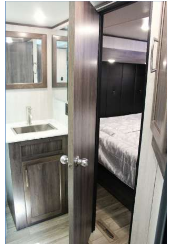
Private Bedroom Access