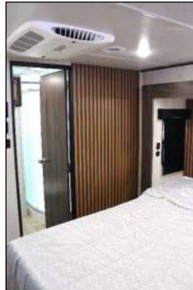
Private Lavy Access