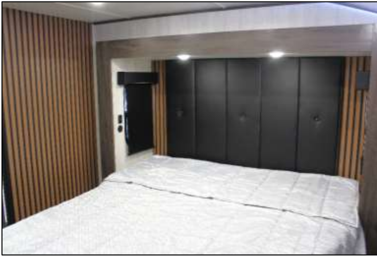
King Bed In Slideout