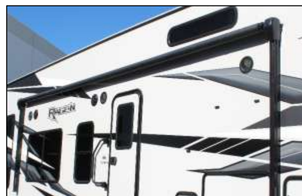
Powered Awning w/LED Strip