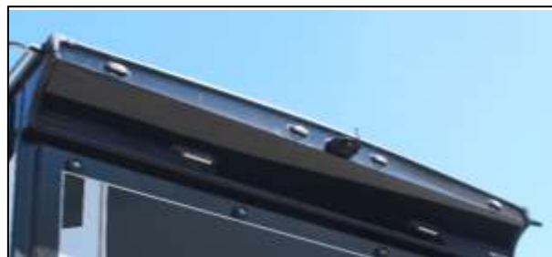
Optional Rear Camera