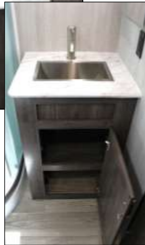
Medicine Cabinet, Under-Sink Storage