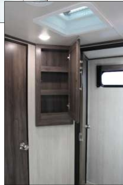
Generous Bath Storage