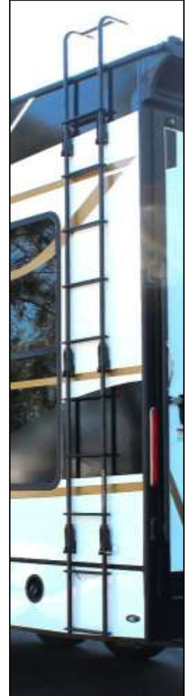
Exterior Ladder & Walk-On Roof