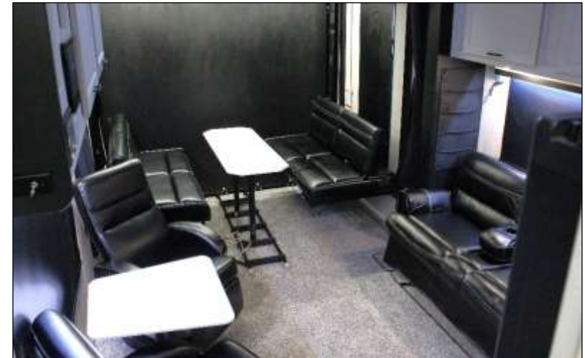
Opposing Rear Dinette