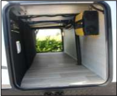
Pass-Thru Front Storage