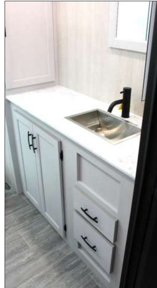
Stainless Sink/Designer Fixture