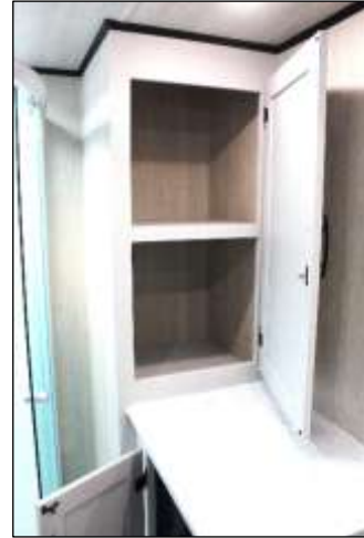
Generous Shower/Lavy Storage