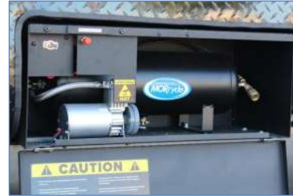
Optional On-Board Air Compressor