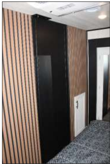
Shiplap Accent Wall w/In-Wall Storage