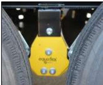
Optional Equi-Flex® Suspension