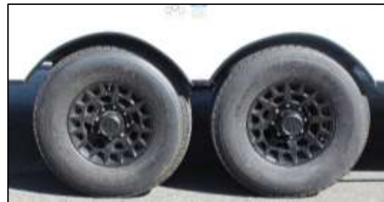
16" Deluxe Aluminum Alloy Wheels