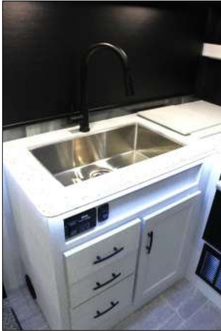
Deep Stainless Sink w/Single Handle Faucet Solid Surface Countertops