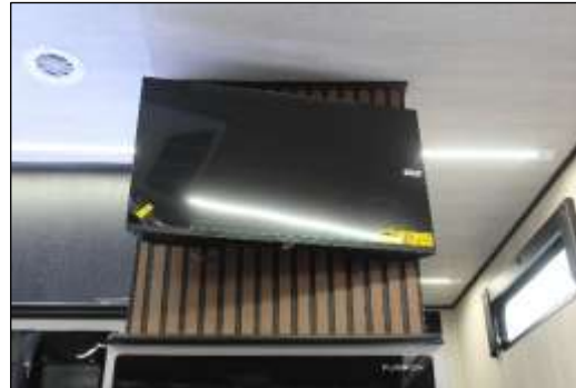
Optional 32" Living Area TV