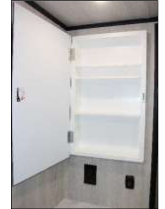
Mirrored Medicine Cabinet