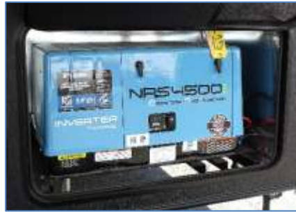
Yamaha 4.5KW Generator