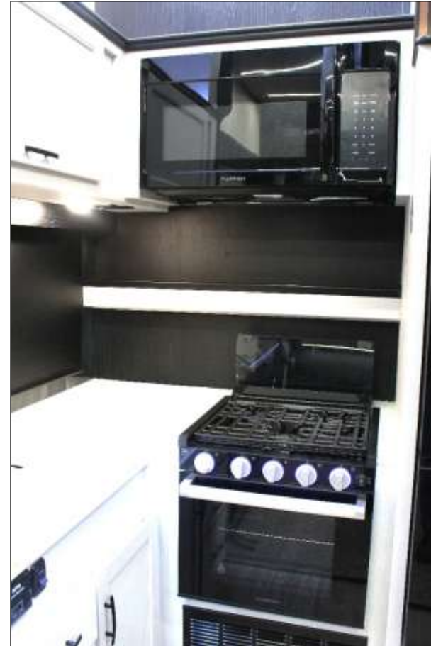
Efficient Meal Prep Center 3-Burner, Glass Top Range w/Oven