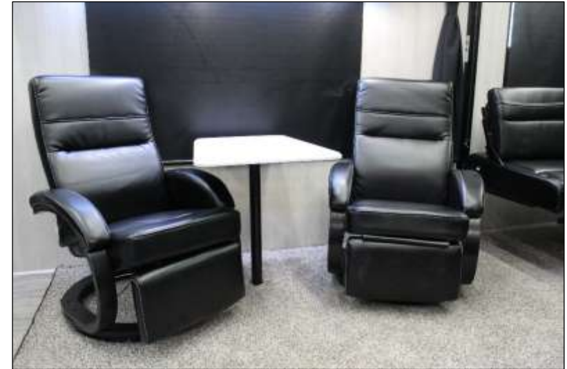
Two Swivel/Rockers w/Table