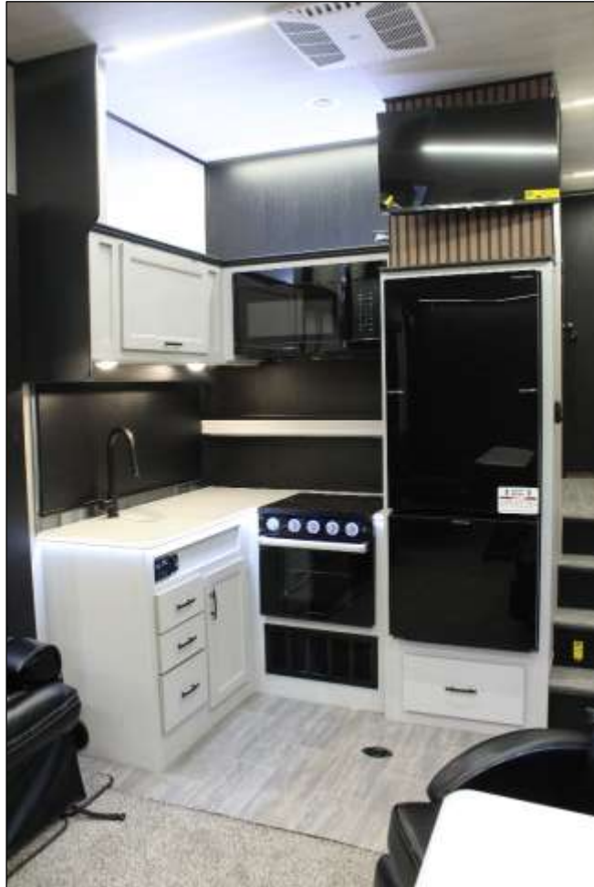
Spacious, Open Floorplan