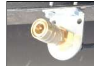
On-Board Air Quick Connect