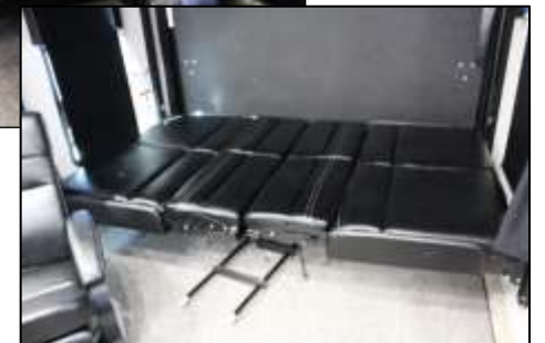
Optional Power Dinette Bed