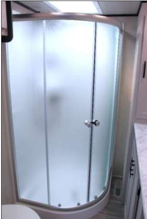
Fiberglass Shower w/Glass Door, Overhead Skylight & Designer Fixtures