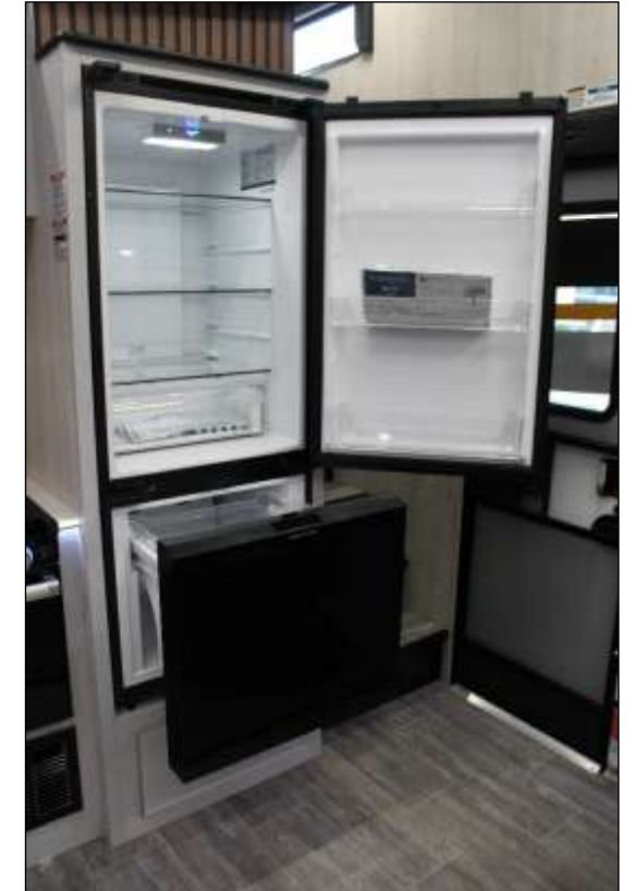
12-Volt, 10 Cu. Ft. Refrigerator