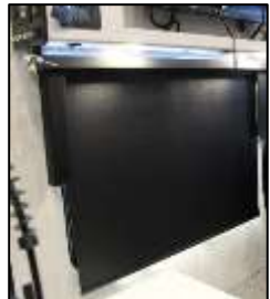
Black Roller Shades Throughout