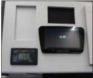
Audio Control Center/ Solar Controls