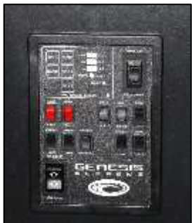
Central Monitor/Control Panel