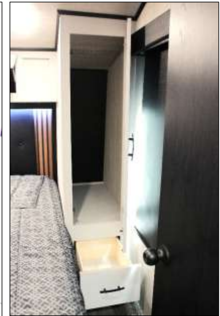
Deep Drawer/Wardrobe Storage