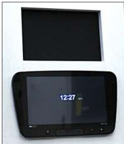
Upgraded FM/AM Bluetooth® Audio