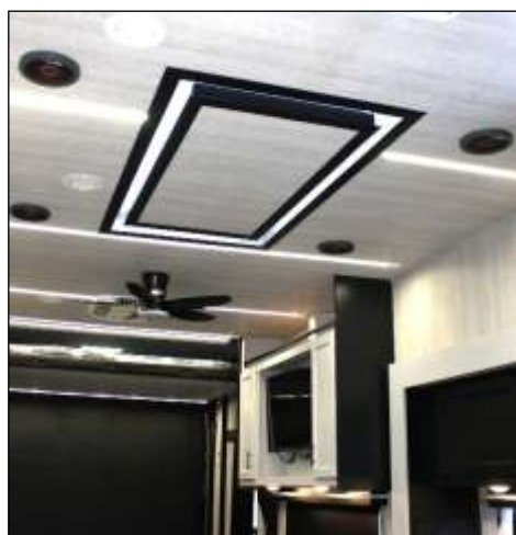
Accent & Overhead Lighting