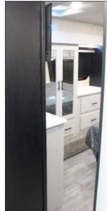
Private Bedroom Access