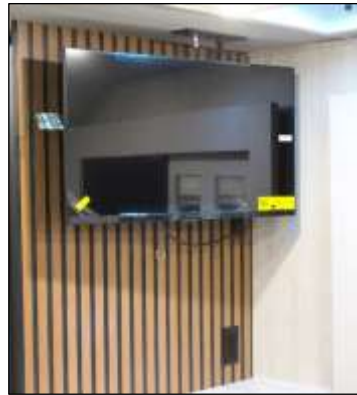
32" Bedroom TV