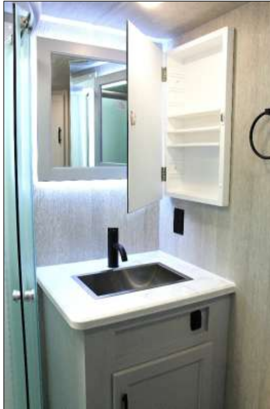
Metal Lavy Sink w/Single Handle Fixture/ Solid Surface Cabinet Top