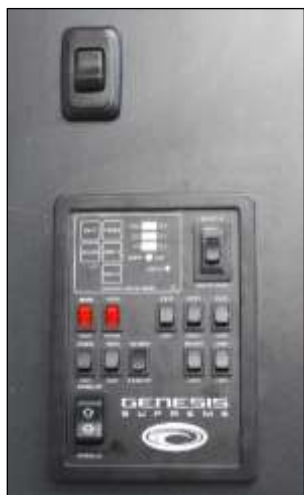
Convenient Monitor & Lighting Control Center