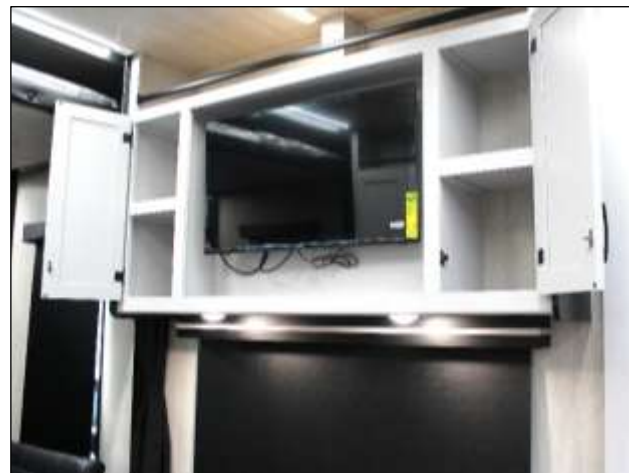
40" Living Room TV & Media Storage