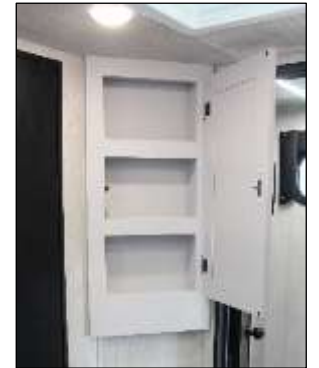
Overhead & Wall Shelf Cabinet Storage