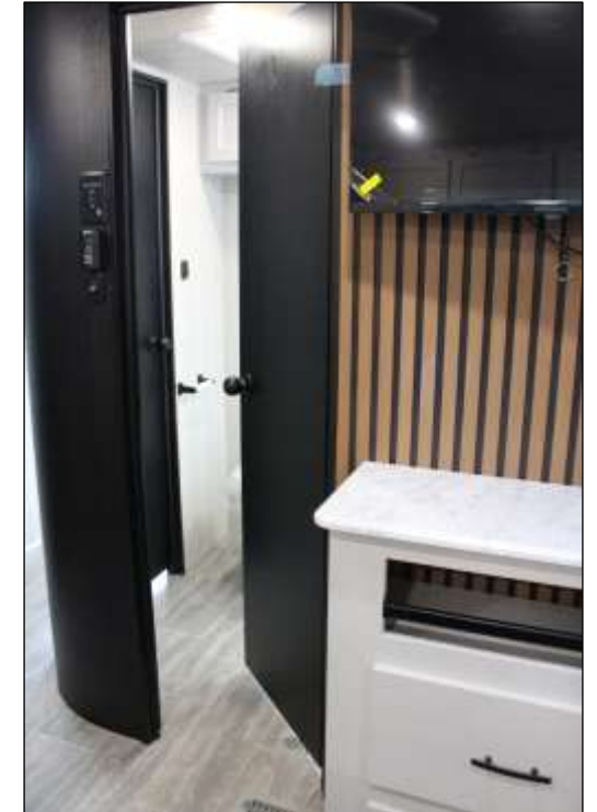
Private Lavy Access