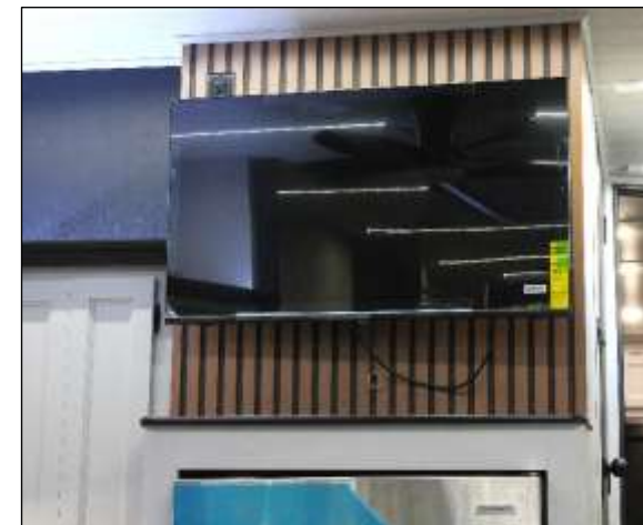
32" Living Room TV Over Refrigerator