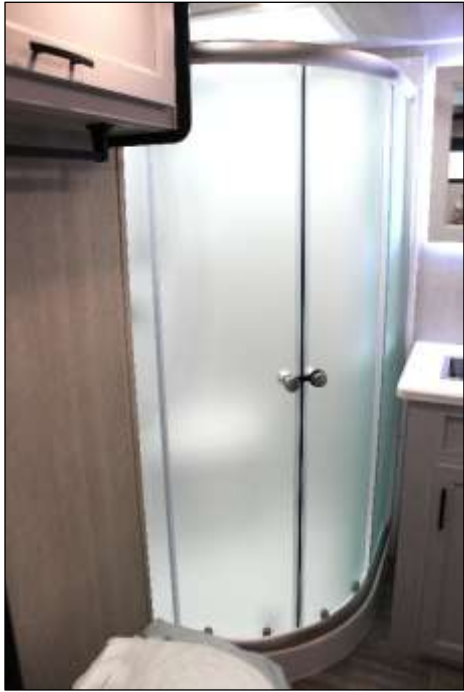
Large Fiberglass Shower w/Curved Glass Door & Skylight Above