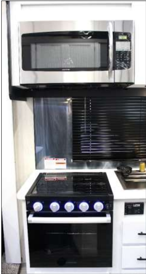
3-Burner Cooktop/Oven Optional Residential Microwave

Convenient, Efficient Meal Prep Center w/Plenty of Storage