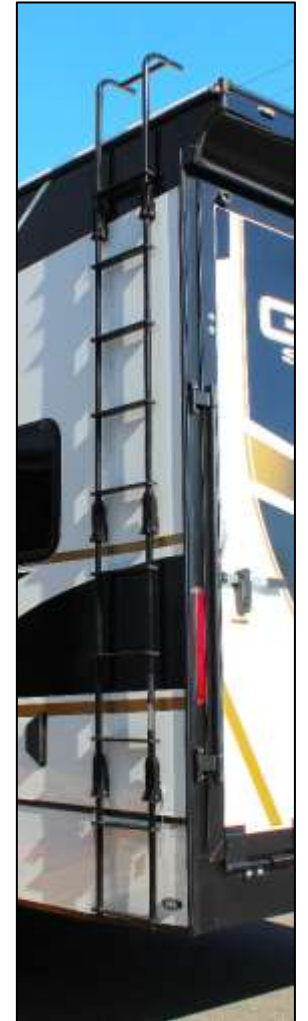
Exterior Folding Ladder & Walk-On Roof