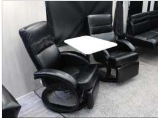
Dual Swivel Rockers w/Table