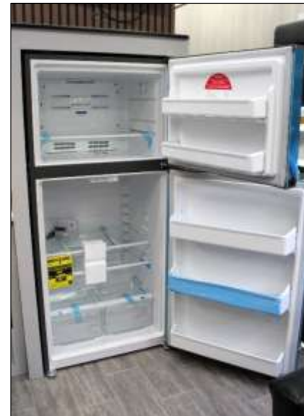
Double-Door Residential Refrigerator