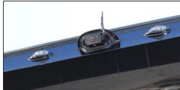
Patented Spoiler w/Wireless Backup Camera