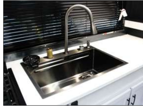
Stainless, Waterfall Sink