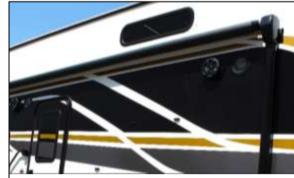
Powered Awning w/LED Strip