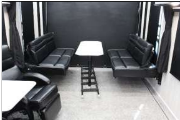
Power Opposing Dinette