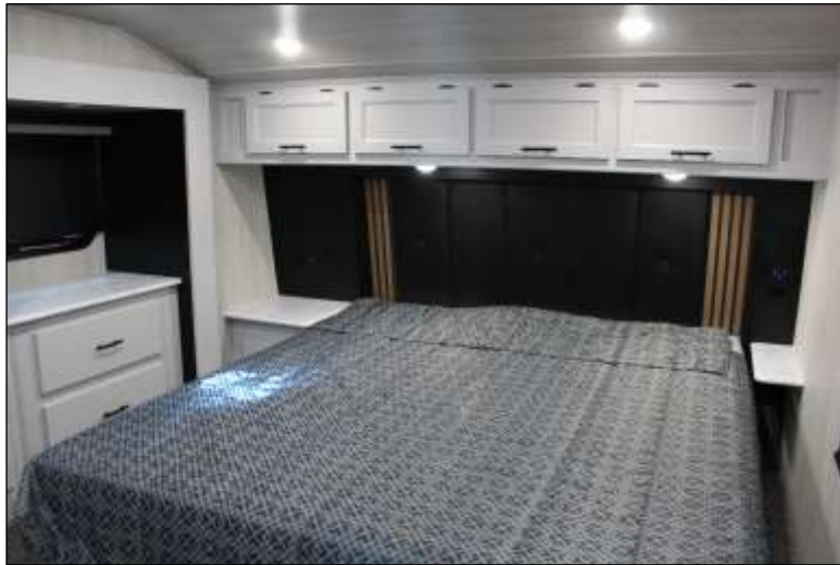
Memory Foam Mattress/Coordinated Bedspread