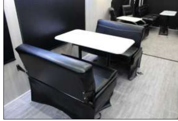
Side Opposing Dinette