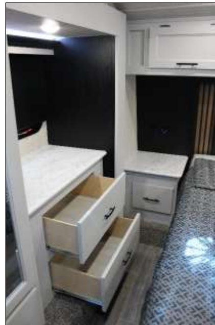
Generous Overhead & Wardrobe Storage