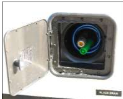
Water Hose Sprayer