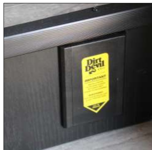
Optional Central Vacuum System