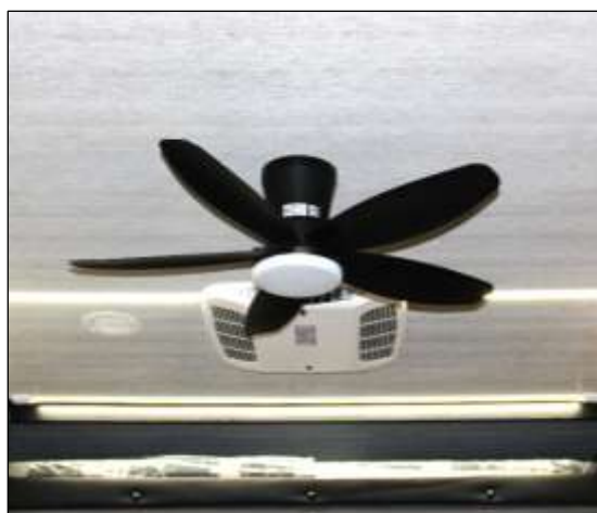
Residential-style Ceiling Fan