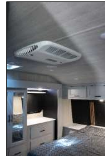
Ceiling-mounted A/C w/Wall-mounted Controls