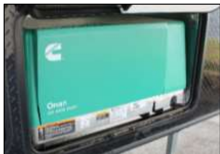
Optional Onan 5.5KW Generator