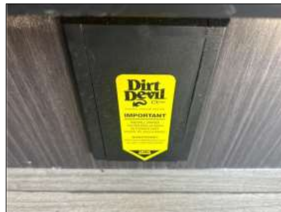
Central Vacuum System