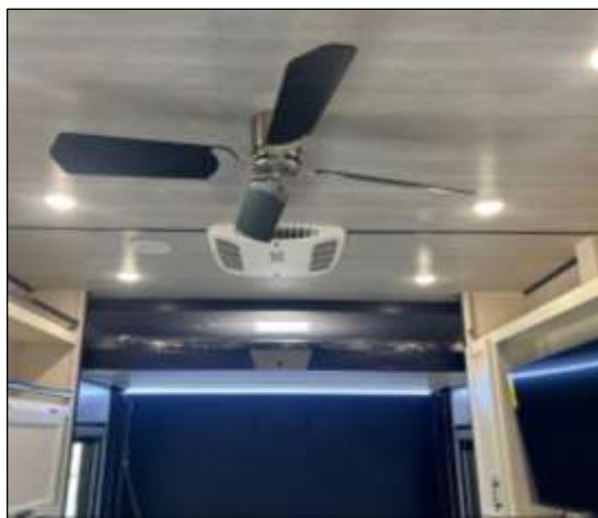
Residential-style Ceiling Fan