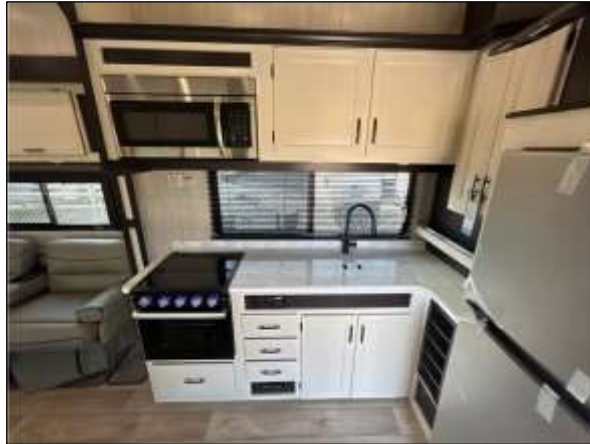
Solid-Surface Countertops & Sink Covers