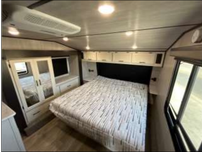
Generous Overhead & Wardrobe Storage