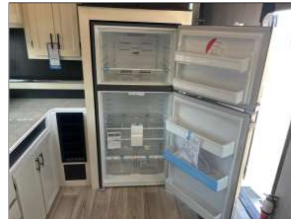
Double-Door Residential Refrigerator