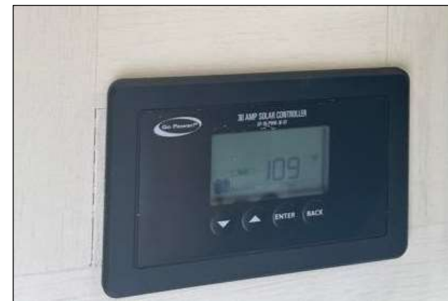
Optional Solar Controller