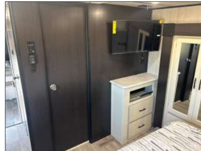
Bedroom TV / Private Lavy Access