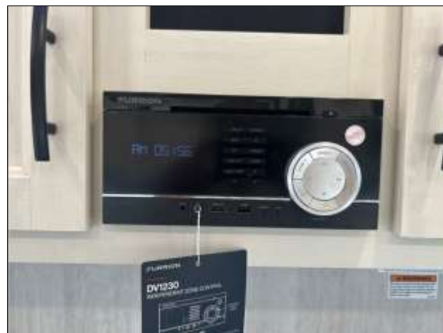
Stereo AM/FM/CD/DVD w/Bluetooth/USB