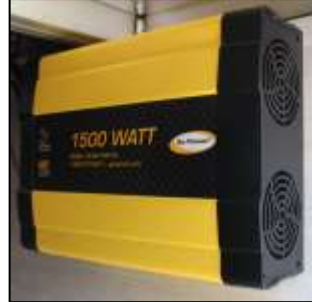
Optional 200W Solar Panels & 1500W Inverter