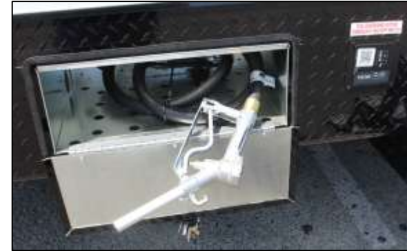
40-Gallon Fuel Station