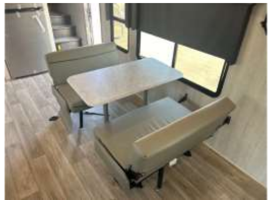
Side Opposing Dinette