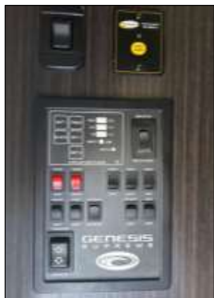
Convenient Monitor & Lighting Control Center