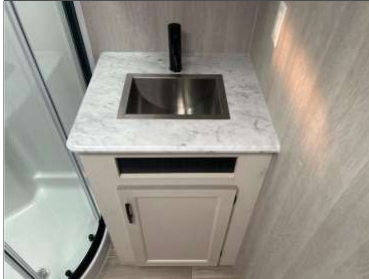
Metal Lavy Sink w/Single Handle Fixture