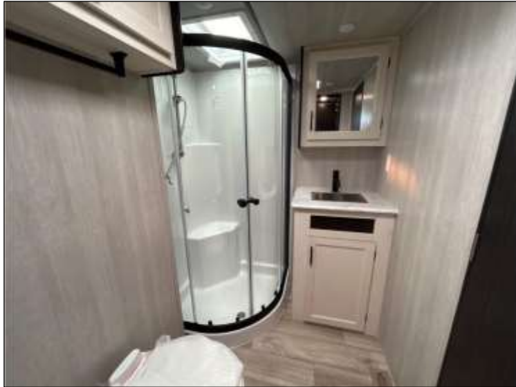
Large Fiberglass Shower w/Curved Glass Door & Skylight Above