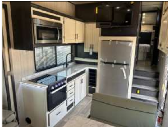
Convenient, Efficient Meal Prep Center w/Plenty of Storage