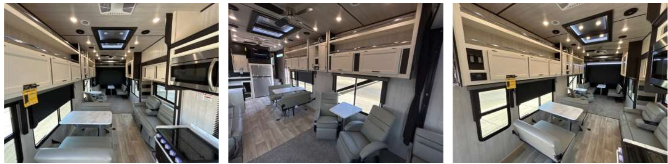
Spacious, Open Floor Plan with Abundant Overhead Storage