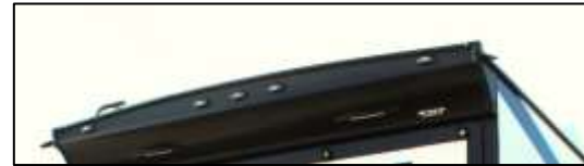
Patented Spoiler w/Wireless Backup Camera