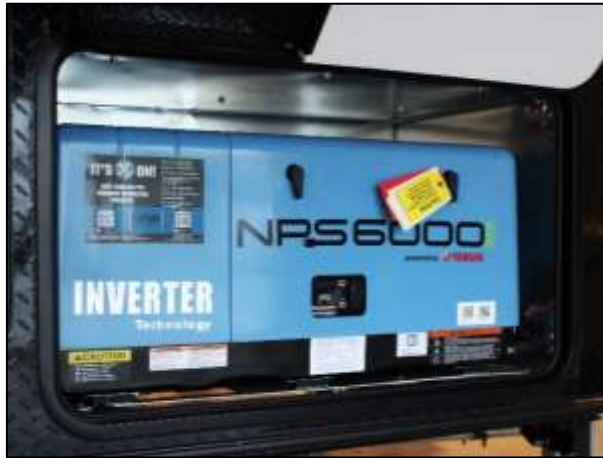
Optional Yamaha 6.0KW Inverter/Generator