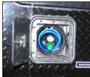
Water Hose Sprayer