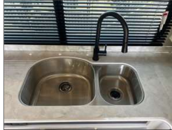
Stainless, Dual-Basin Sink w/Single Handle Faucet