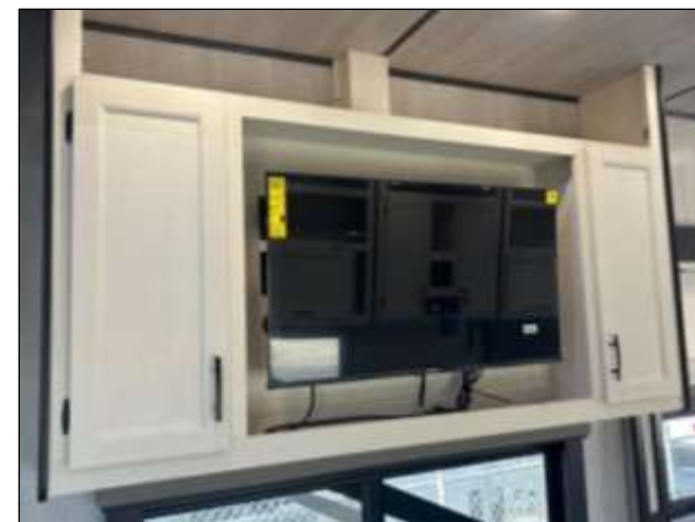
Living Room TV & Media Storage