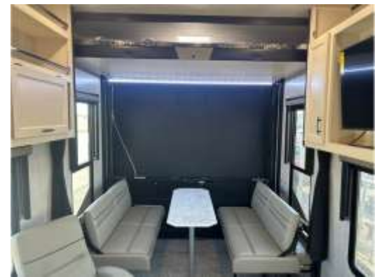
Power Opposing Dinette