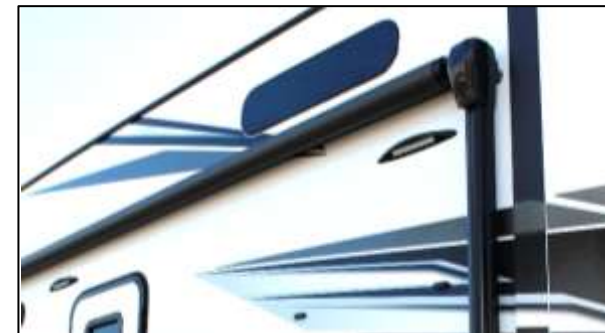
Powered Awning w/LED Strip