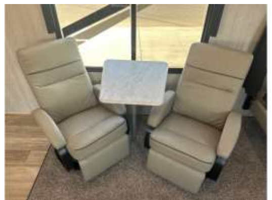
Dual Swivel Rockers w/Table