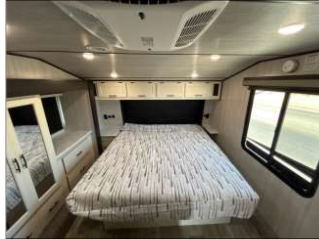
Memory Foam Mattress/Coordinated Bedspread