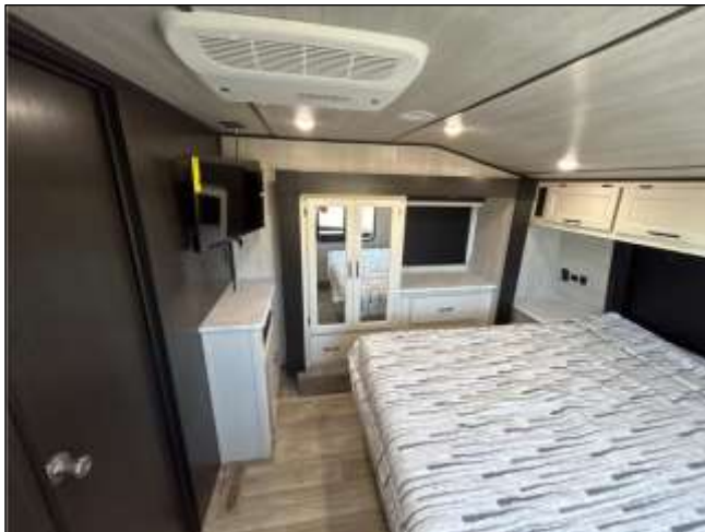
Ceiling-mounted A/C with wall-mounted Controls