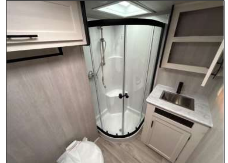
Premium Designer Fixtures & Solid Surface Cabinet Top