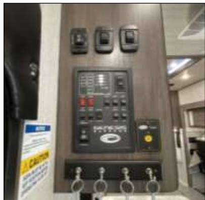
Convenient Monitor & Lighting Control Center