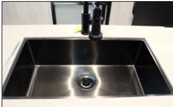
Deep Stainless Sink w/Pull-Down Faucet