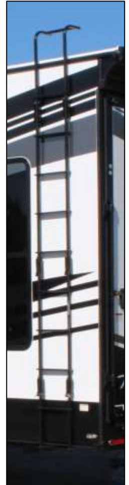
Exterior Folding Ladder & Walk-On Roof