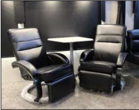
Two Swivel/Rockers w/Table (Optional Euro Recliners Shown)