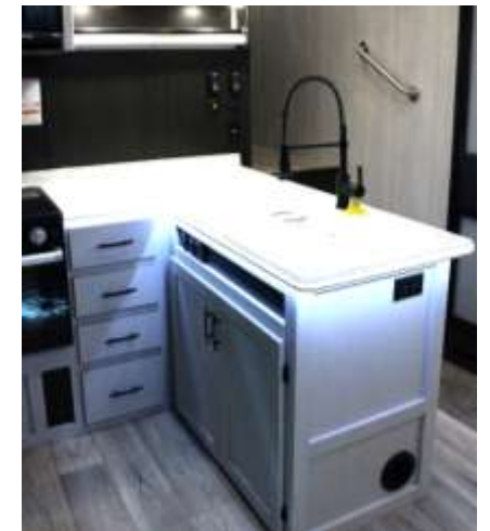
Solid Surface Countertops