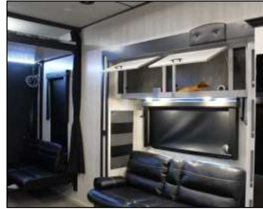
Generous Slideout Overhead Storage