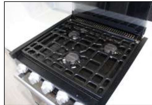
3-Burner Glass-Top Range w/Oven