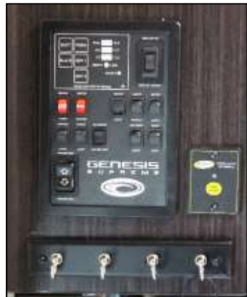
Central Monitor/Control Panel