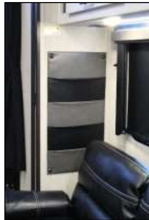
Slideout Magazine Rack