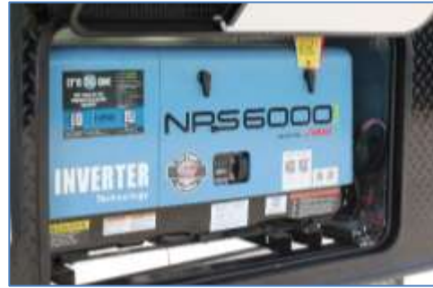
Optional Yamaha 6.0KW Generator