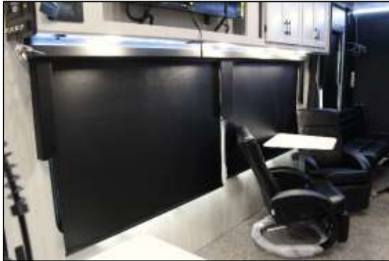
Black Roller Shades Throughout