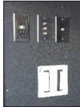
Exterior TV Hookups & Bracket