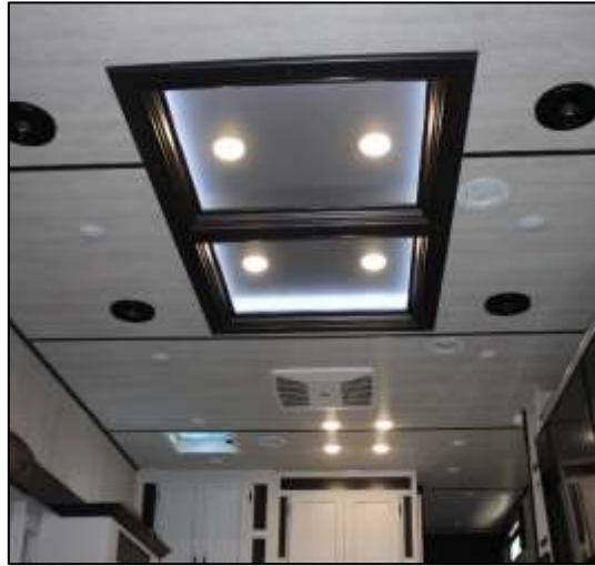
Coffered Ceiling Panel w/LED & Accent Lights