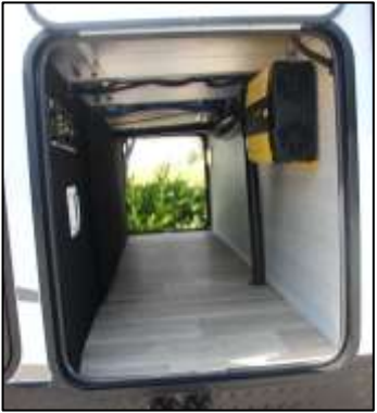
Pass-Thru Front Storage