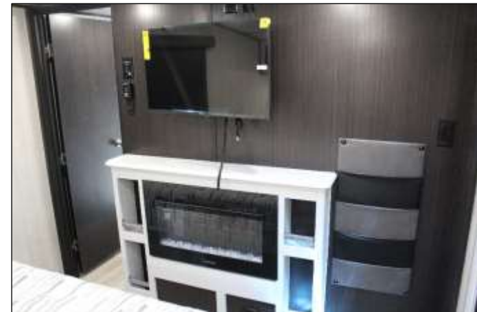
32" Bedroom TV/Electric Fireplace