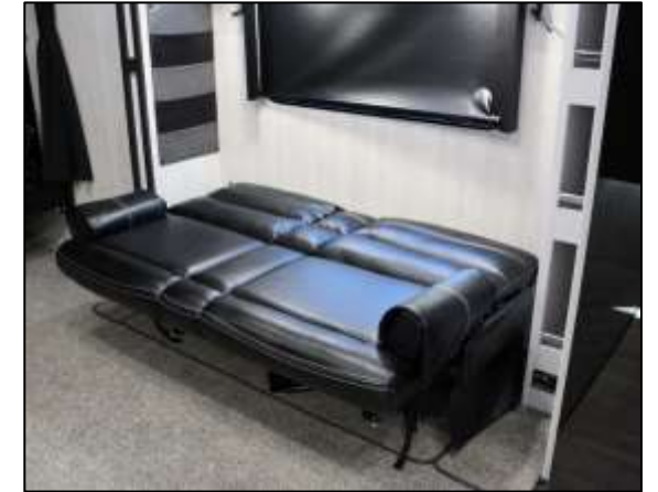
Slideout Sofa Bed