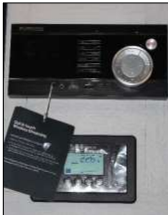
Media Control Center