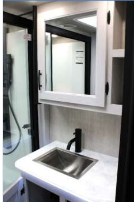
Stainless Sink/Single Handle Faucet/Mirrored Medicine Cabinet