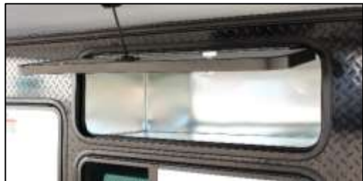
Optional Tool Box