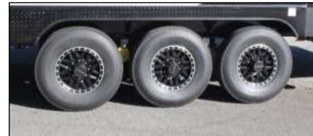
16" Deluxe Aluminum Alloy Wheels