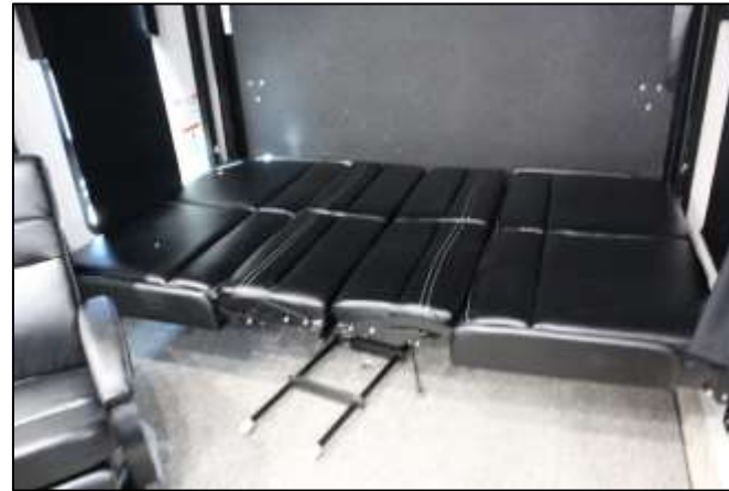
Optional Power Dinette Bed