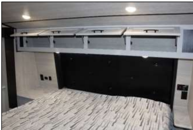
Overhead & Deep Drawer/Wardrobe Storage