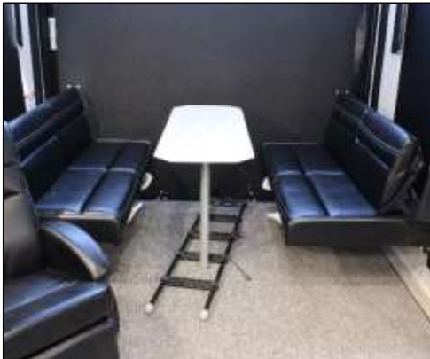
Opposing Rear Dinette w/Table