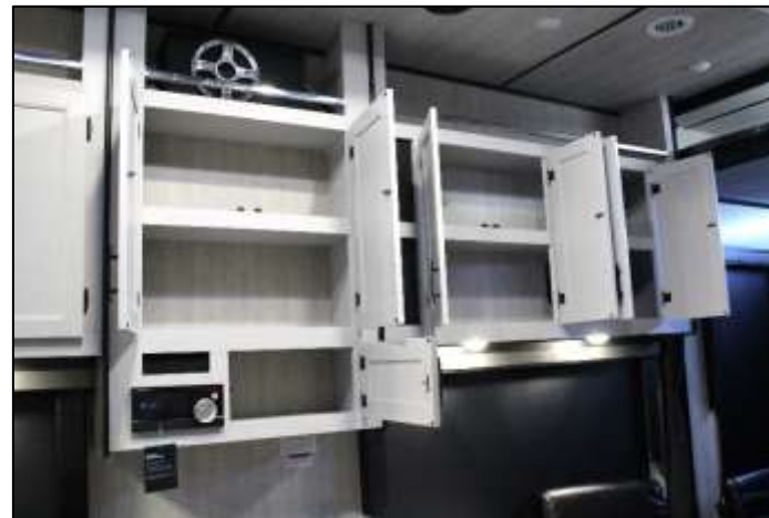
Generous Overhead Storage