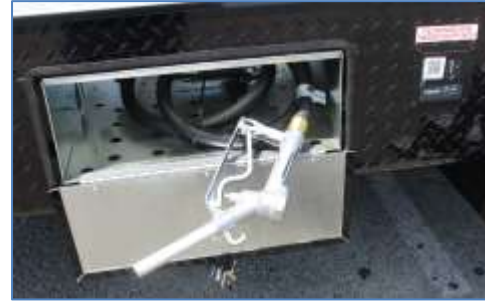
40-Gallon Fuel Station