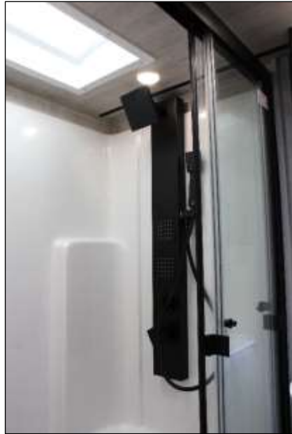
Fiberglass Shower w/Glass Door, Designer Fixture & Overhead Skylight