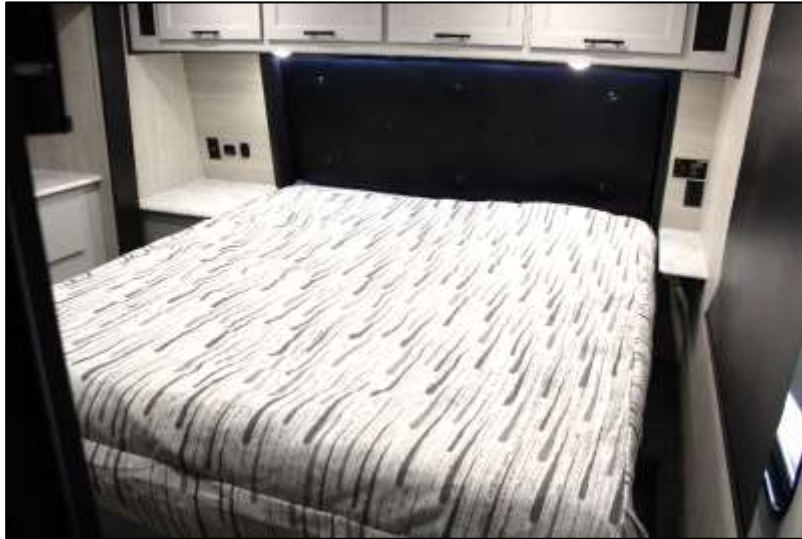
Walk-Around King Bed