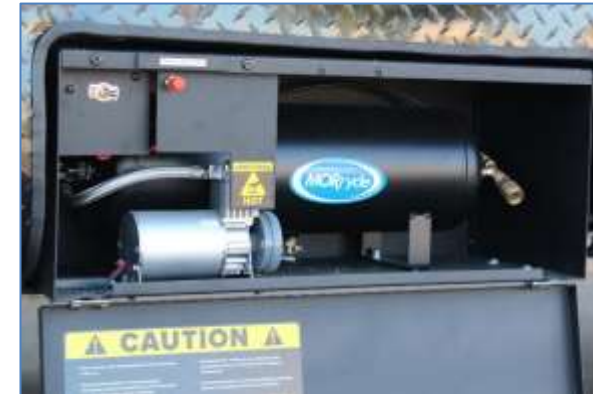
Optional On-Board Air Compressor