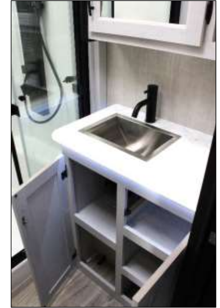
Generous Shower/Lavy Storage