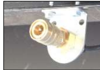
On-Board Air Quick Connect