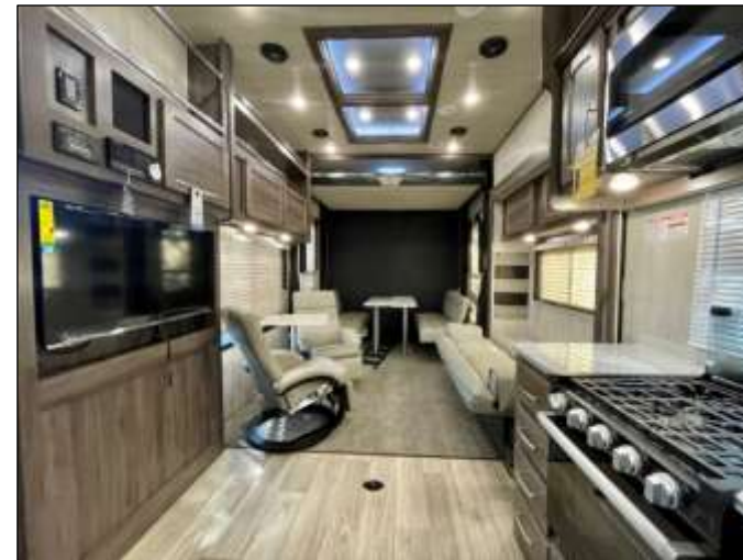
Spacious, Open Floorplan Interior Ceiling & Accent Lighting