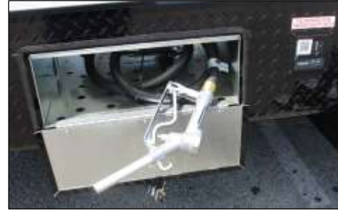
40-Gallon Fuel Station