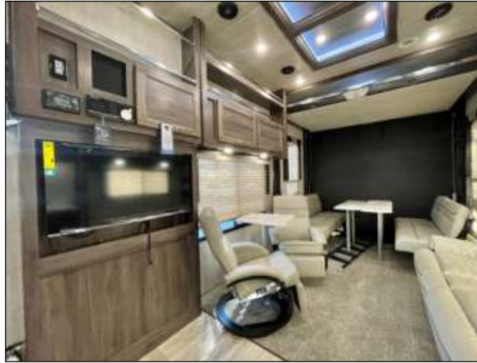
Entertainment Center w/40" TV