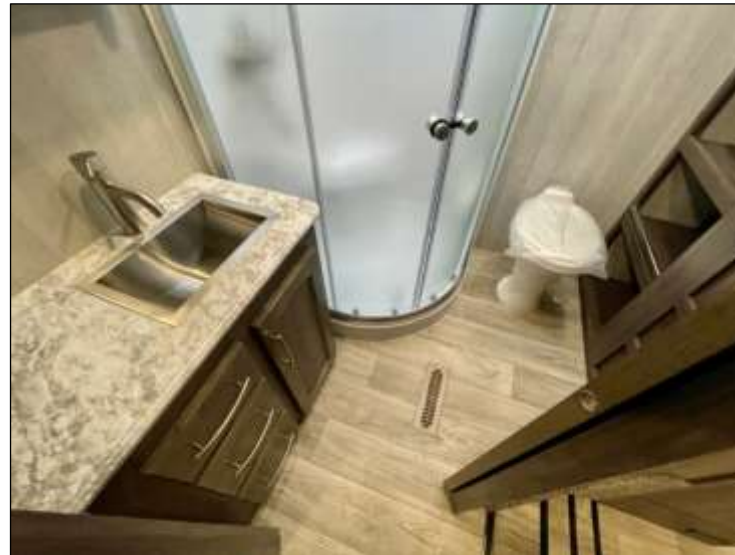
Solid Surface Cabinet Top/ Stainless Sink w/Single Handle Faucet