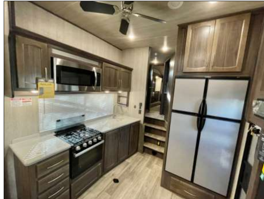
Efficient Meal Prep w/Generous Galley Storage