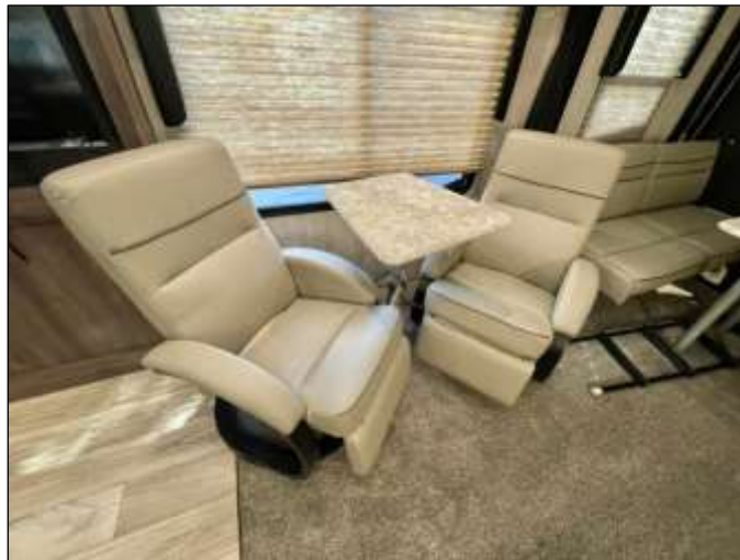
Optional Euro Recliners w/Table