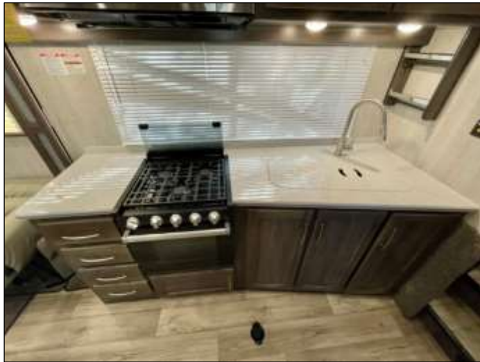
Solid Surface Countertops w/Sink Covers 3-Burner, Glass Top Range/Oven