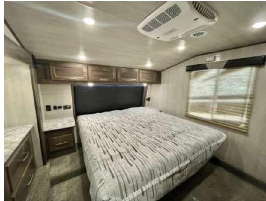
Walk-Around Bed / Overhead and Bedside Storage