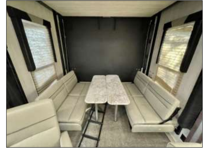
Opposing Power Dinette