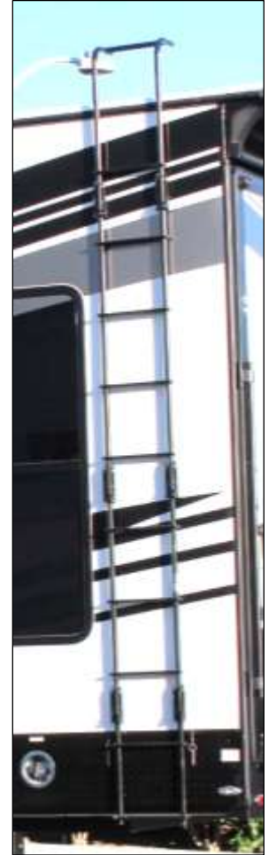
Exterior Folding Ladder & Walk-On Roof