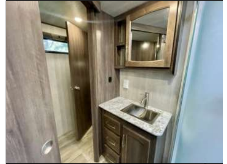
Mirrored Medicine Cabinet Under-Sink Storage