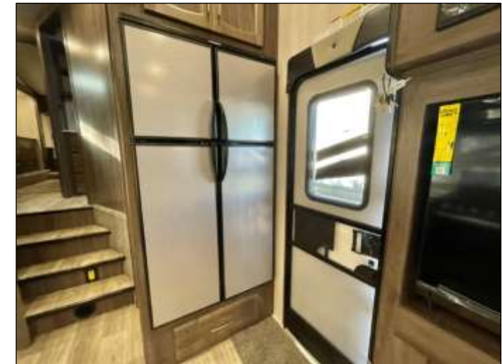
Optional Double-door Refrigerator