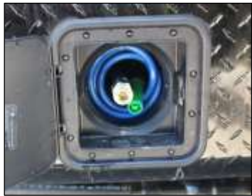
Water Hose Sprayer