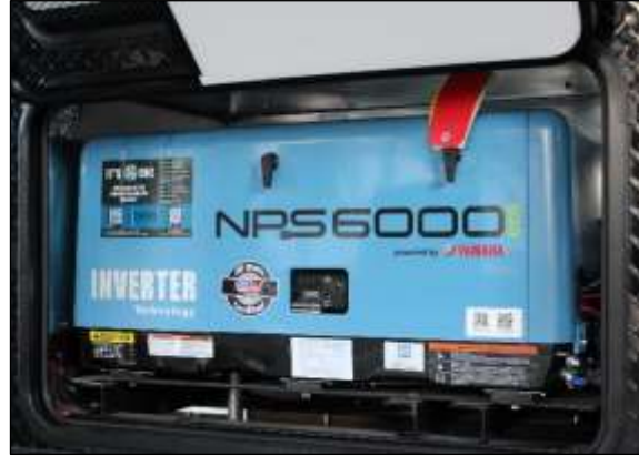
Yamaha 6.0KW Inverter Generator