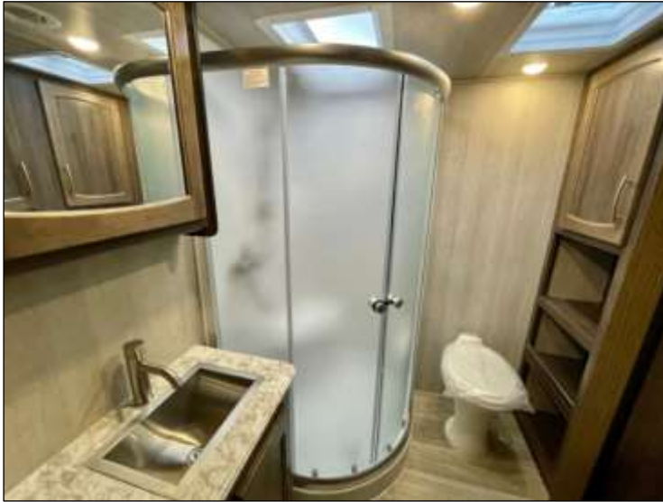
Curved Glass Shower Enclosure Generous Bath Storage