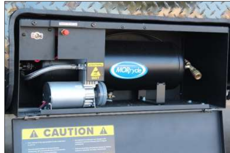
Optional On-Board Air Compressor