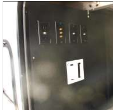
Exterior TV Hookups & Bracket