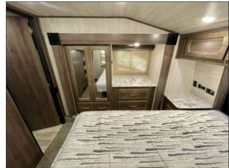
Mirrored Slideout Wardrobe & Vanity w/Deep Drawer Storage