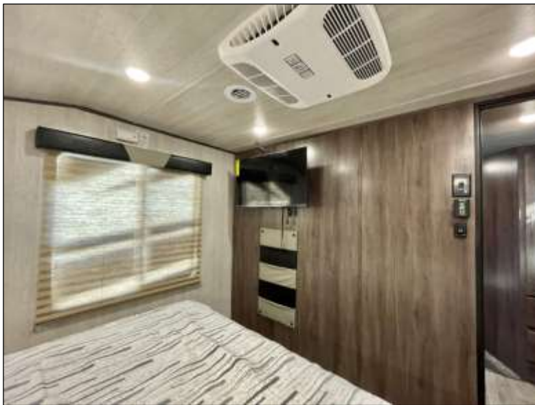
32" Bedroom TV w/Swivel Bracket Ceiling-Mounted A/C w/Wall Controls