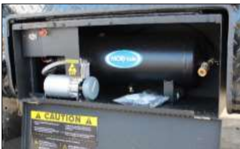
12V On-Board Air Compressor