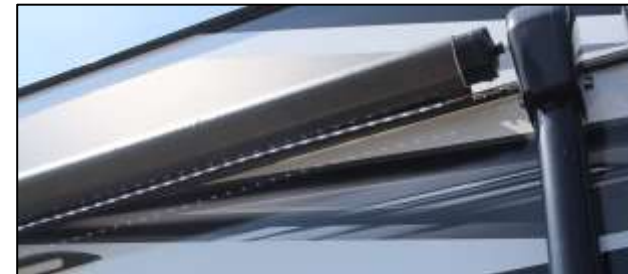
Powered Awning w/LED Strip