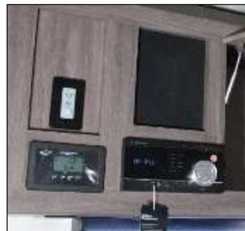
Solar & Stereo Controls