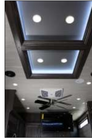
Decorative/Functional Overhead Lighting