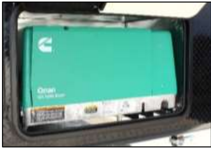
Optional Onan 5.5KW Generator