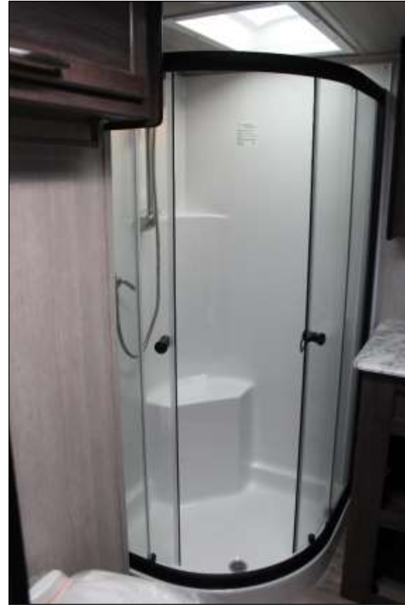
One-Piece Shower w/Curved Glass Surround & Overhead Skylight