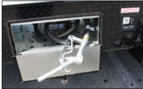
40-Gallon Fuel Station