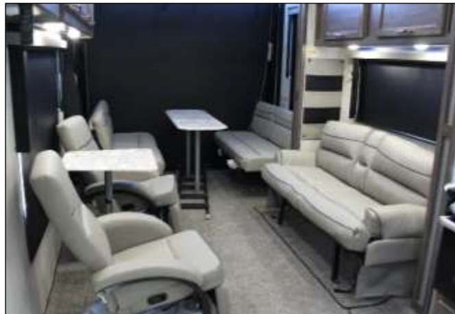
Roomy Seating (Shown with Slideout Retracted & Optional Sofa)