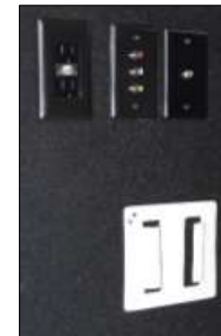
Exterior TV Hookups