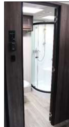
Private Lavy Access