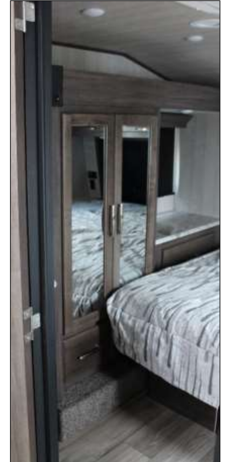
Private Bedroom Access