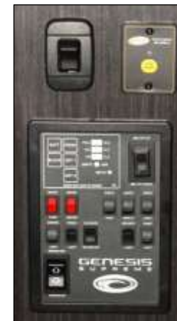
Centralized Monitor, Lighting & Inverter Controls