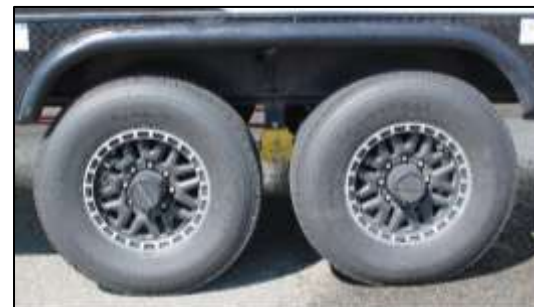
16" Aluminum Alloy Wheels