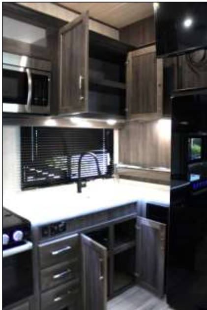
Solid Surface Countertops