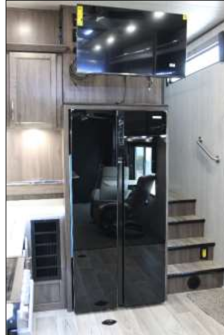
Optional Double-Door Refrigerator