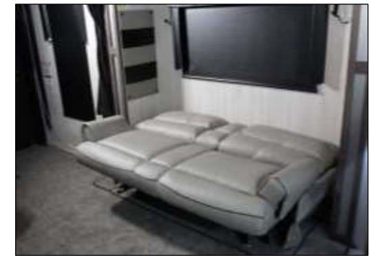
Optional Slideout Sofa (Shown with Slideout Extended)