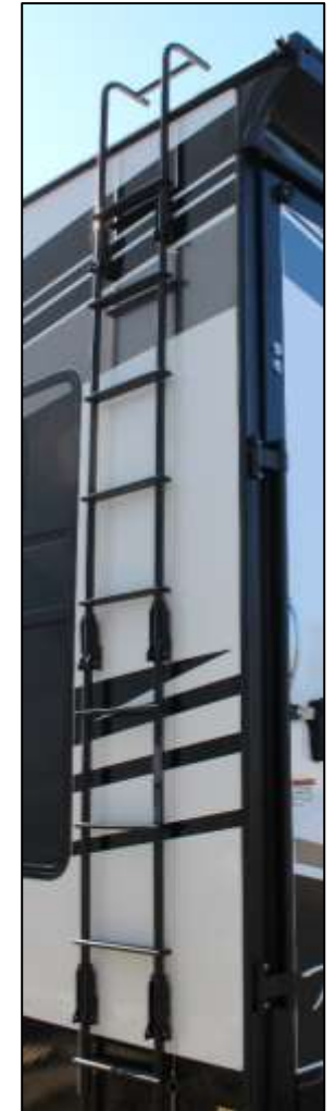
Exterior Folding Ladder & Walk-On Roof