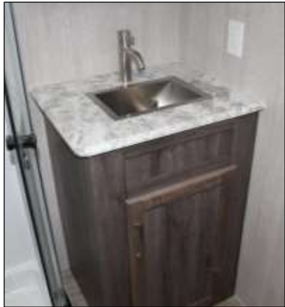
Mirrored Medicine Cabinet Stainless Sink / Solid Surface Top