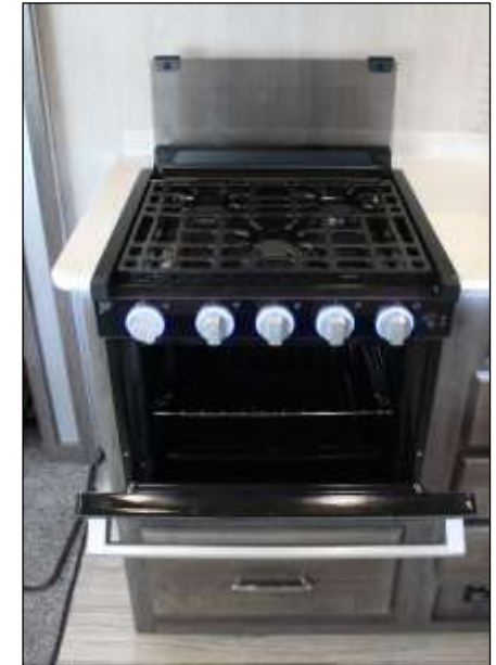
3-Burner, Glass Top Range w/Oven