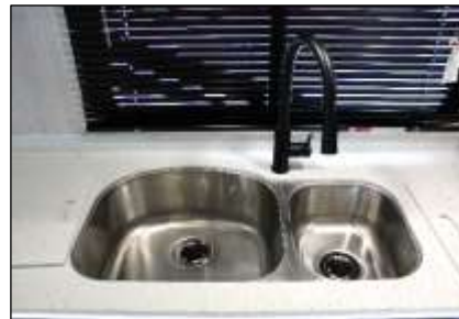
Deep, Double-Basin Stainless Sink w/Covers