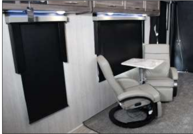
Black Pull-Down Shades Throughout