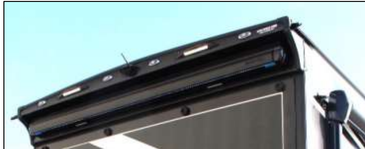
Patented Spoiler w/Rear Camera