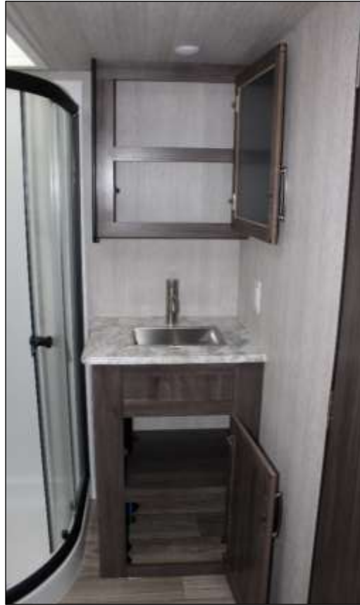
Medicine Cabinet & Under Sink Storage