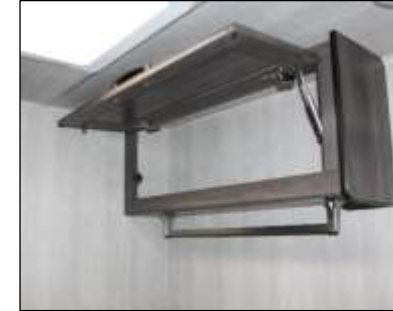
Overhead Cabinet/Towel Bar