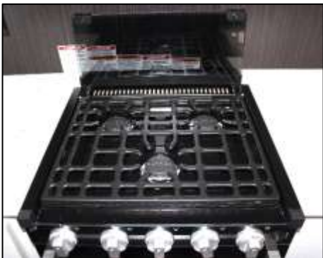
3-Burner Cooktop/Oven w/Glass Cover