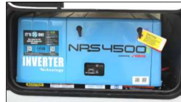
Yamaha 4.5K Generator