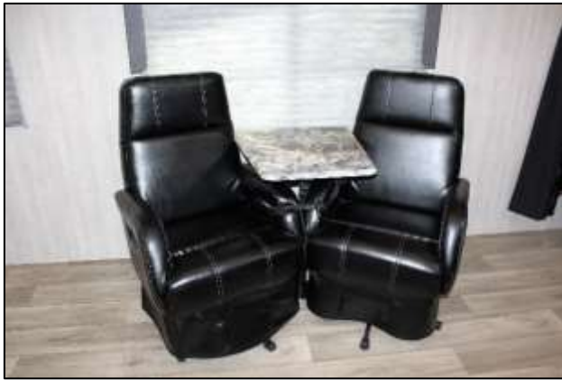
Dual Swivel Rockers