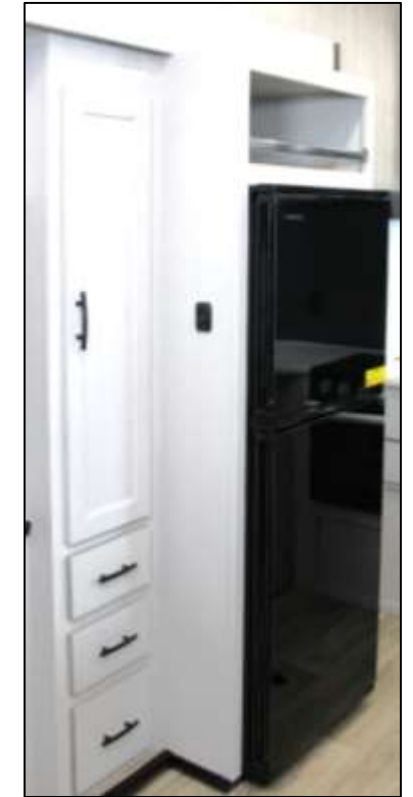
Convenient Pantry Storage Next to Refrigerator