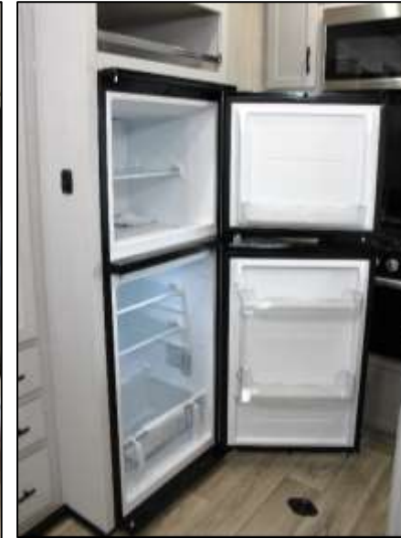
10 Cu. Ft./12Volt/Double Door Refrigerator