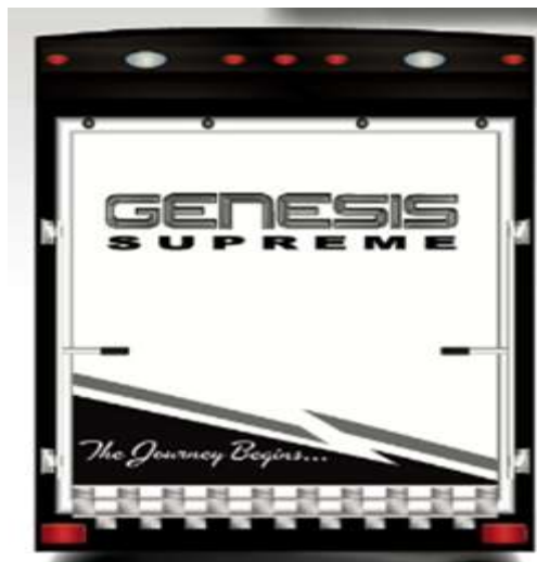
7-Foot Ramp Door