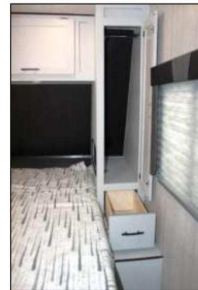
Bedside Wardrobe & Nightstand