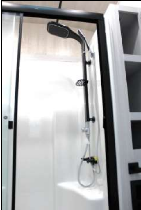
Shower w/ Glass Door