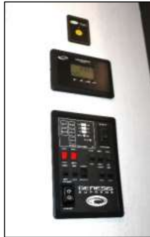
Centralized Monitor/Control Center