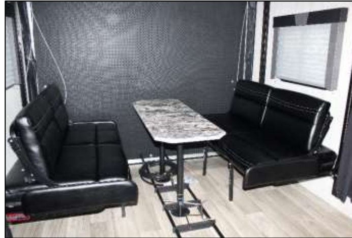
Opposing Power Dinette