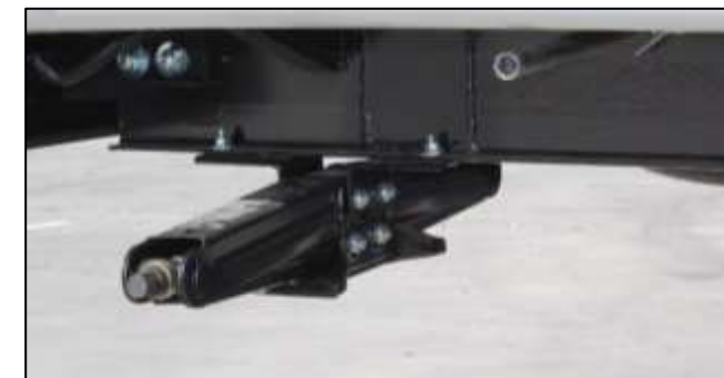
Stab Jacks (Exterior Premier Package)