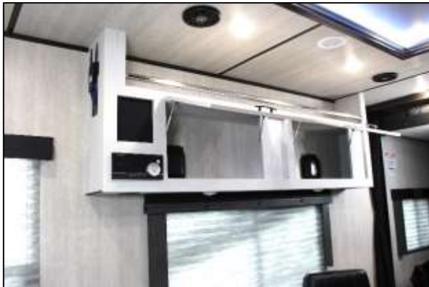
Generous Overhead Storage