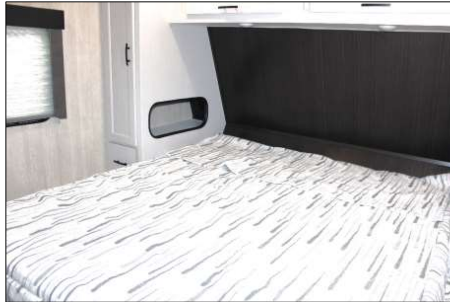
60 X 74 Mattress