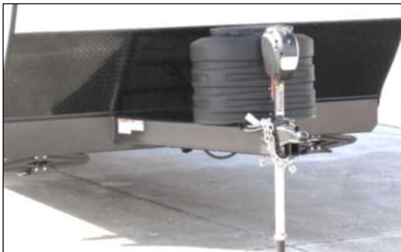
Front Wrap w/Diamond Plate (Shown with Power Jack)