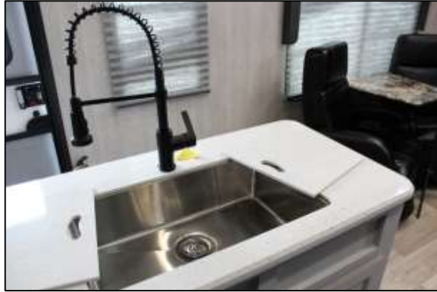
Stainless Galley Sink & Pullout Faucet