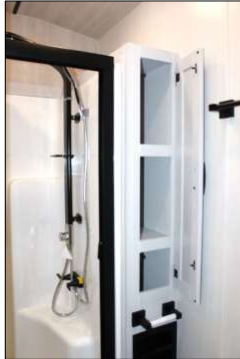
Generous Bath Storage