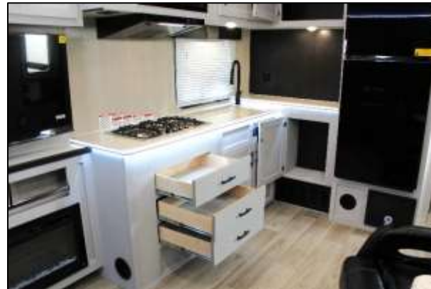
Generous Galley Storage