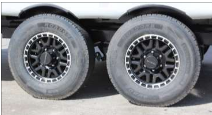
15" Aluminum Wheels/Load Range E Tires