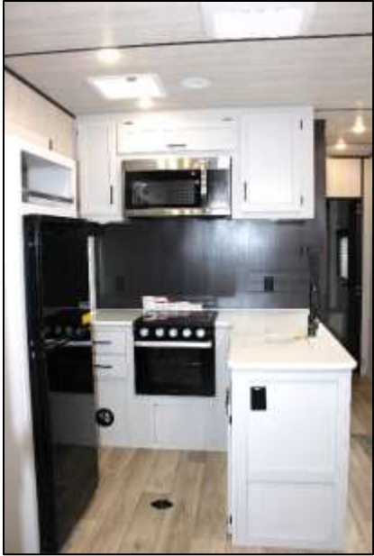
Solid Surface Counter Tops