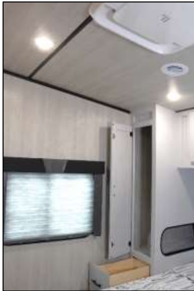
Bedside Wardrobe & Nightstand