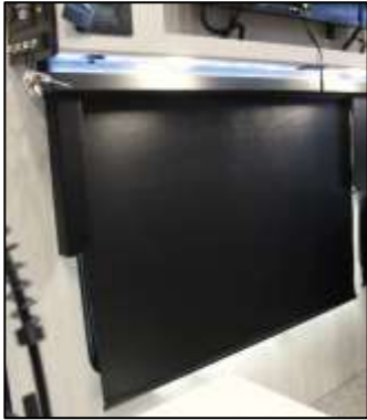
Black Roller Shades Throughout