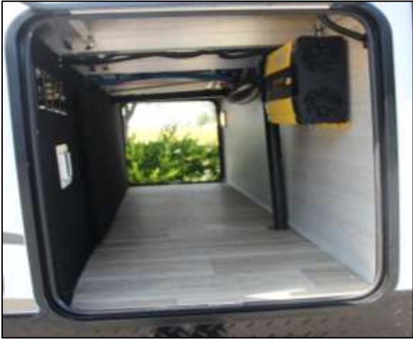
Pass-Thru Front Storage