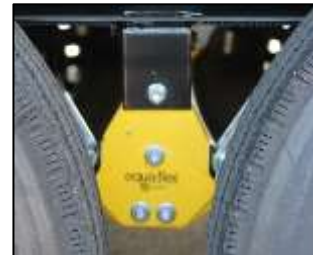
Optional Equi-Flex® Suspension