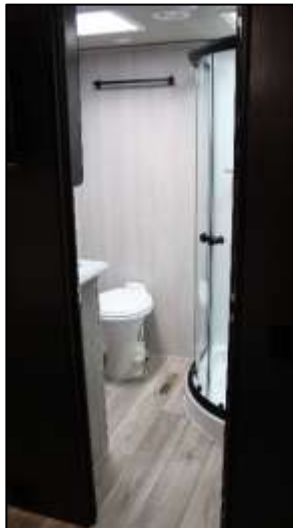
Private Lavy Access