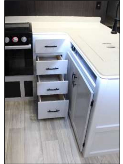
Solid Surface Countertops