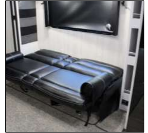
Slideout Sofa Bed