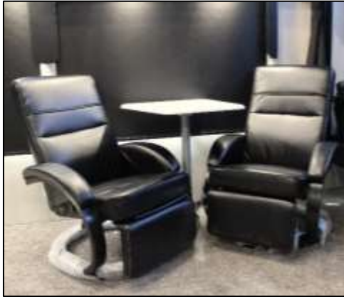
Two Swivel/Rocker w/Table (Optional Euro Recliners Shown)