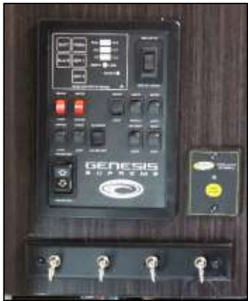
Central Monitor/Control Panel