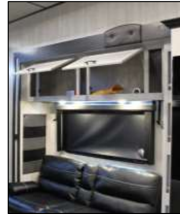
Generous Slideout Overhead Storage