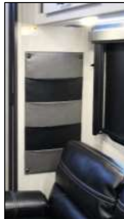
Slideout Magazine Rack