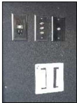
Exterior TV Hookups & Bracket