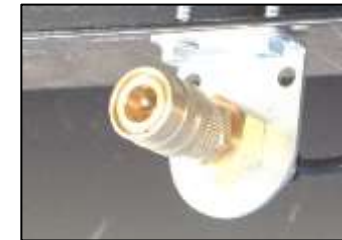
On-Board Air Quick Connect