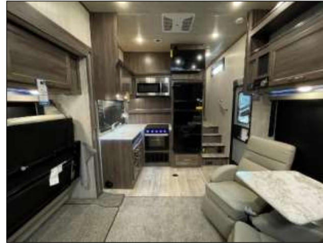
Practical Overhead & Accent Lighting