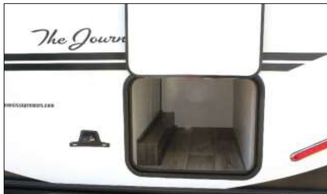
Rear Cargo Trunk