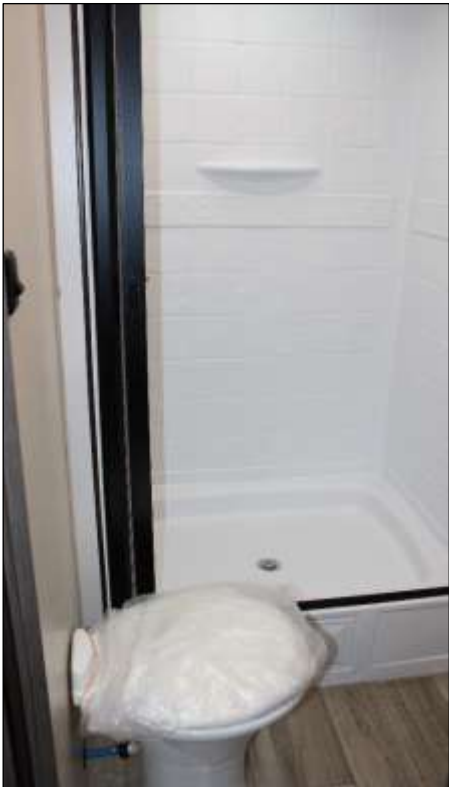
30" X 40" Shower w/Overhead Skylight / Designer Fixture