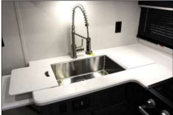
Stainless Sink, Pull-Down Faucet & Solid Surface Galley Top w/Sink Covers