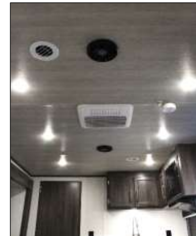
Overhead Lighting/ Ceiling Speakers