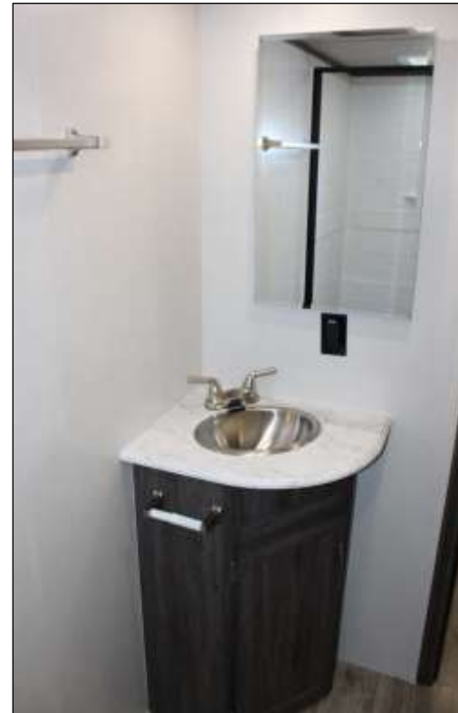
Solid Surface Lavy Top w/Designer Fixture Mirrored Medicine Cabinet Above/Storage Below