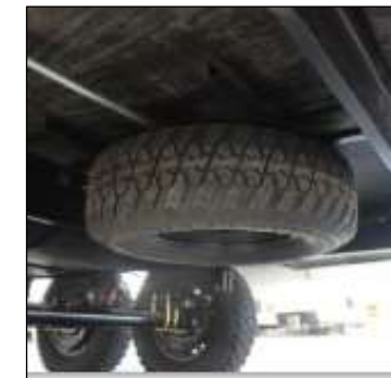
Full-Size Undermount Spare Tire