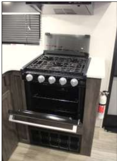
3-Burner Cooktop w/Oven Microwave/Vent Fan Above