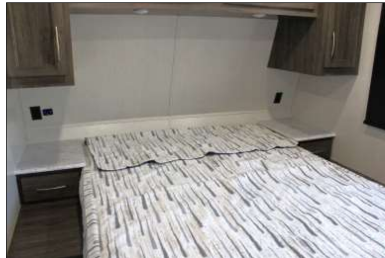
60" X 74" Queen Bed w/Coordinated Bedspread