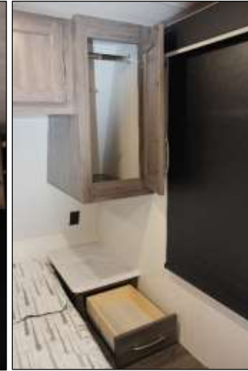
Overhead Storage & Dual Nightstands/Wardrobes