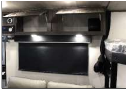
Sofa Overhead Storage