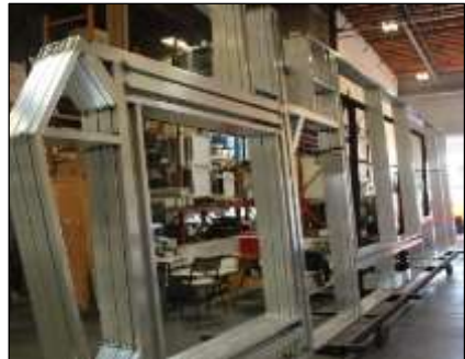
Aluminum, Laminated Sidewalls