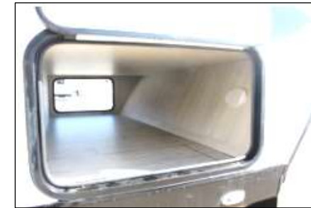
Pass-Thru Storage w/Light