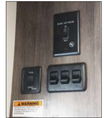
Central Lighting/ Awning/Slideout Controls