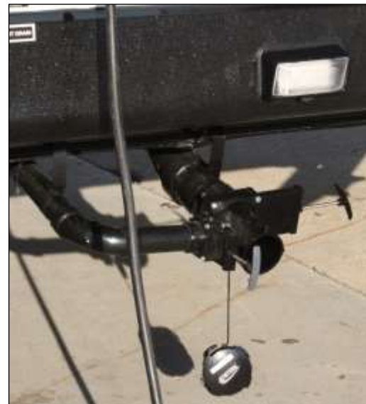
Lighted Drain/Termination Valves