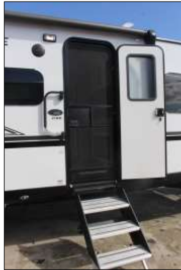
Power Awning w/LED Light Strip, Pull-out & Fold-down Entry Steps, Radius Entry Doors w/Window, Exterior Speakers, Fold-Away Entry Handles