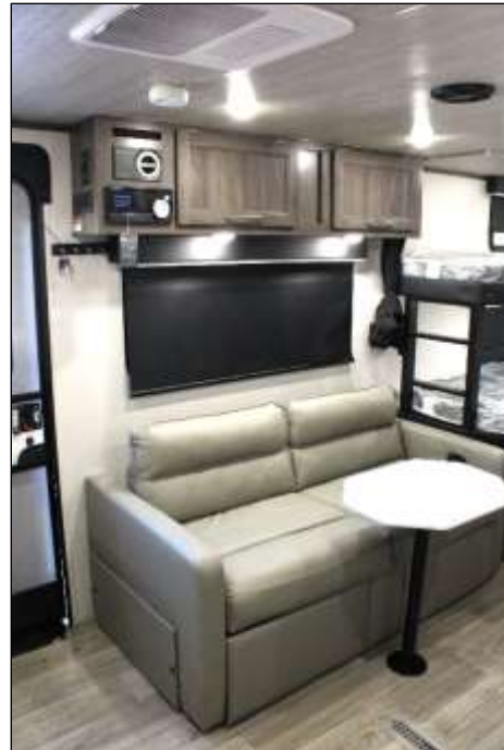
Sofa w/Footrest & Removable Table