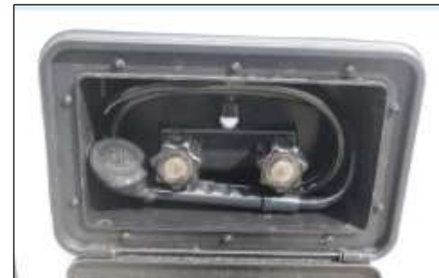
Exterior Hot & Cold Shower