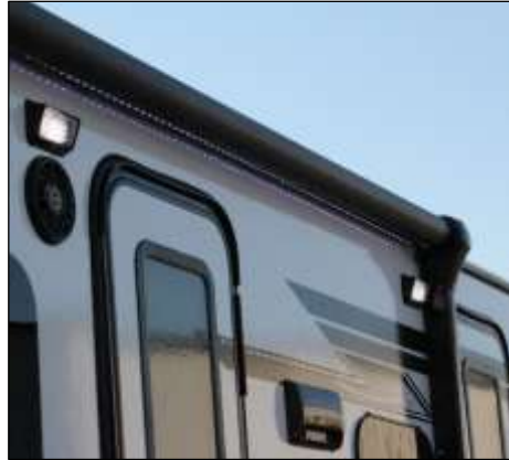
Power Awning w/LED Light Strip/Exterior Speakers