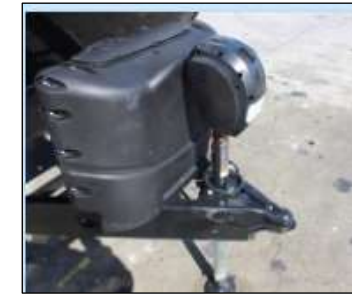
Power Front Jack w/Light