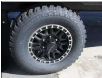
15" Aluminum Wheels