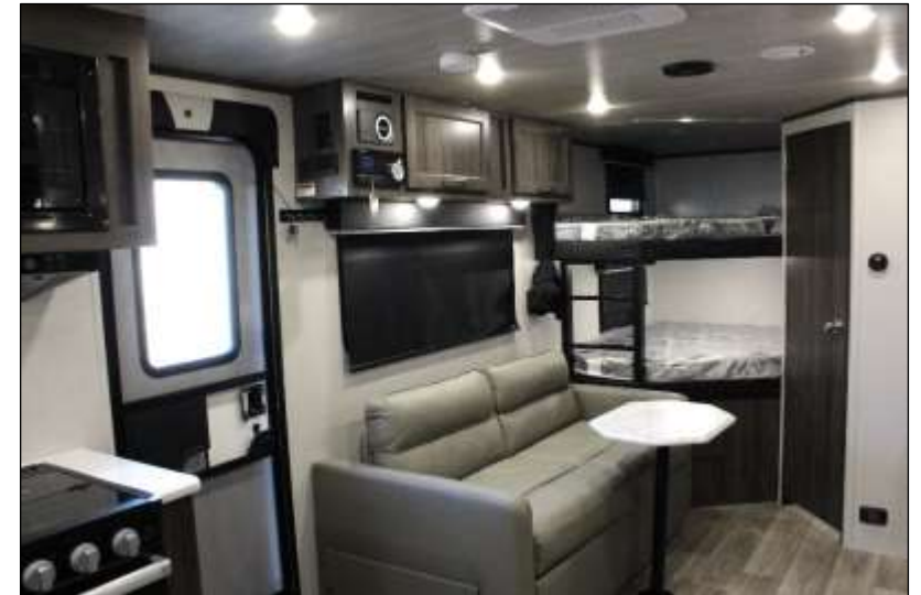
Compact, Comfortable Interior Layout