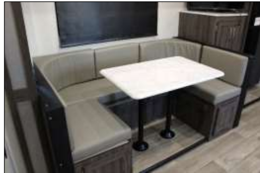
U-Shape Dinette in Slideout w/Storage Below