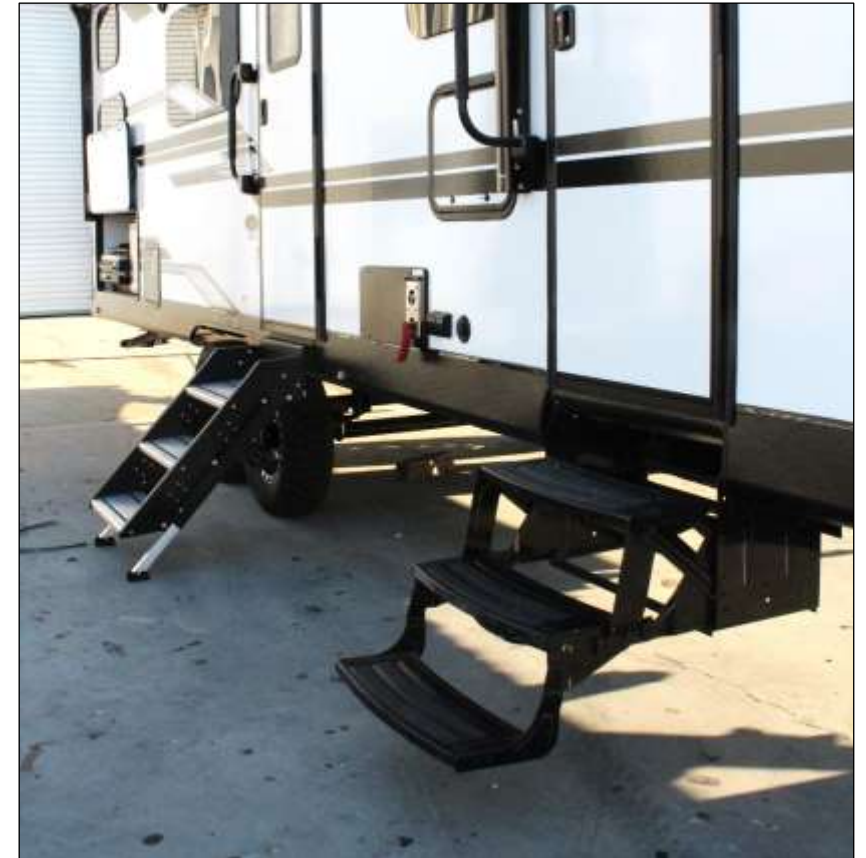
26" Radius Main & Bedroom Entry Doors w/Fold-Down/Pull-Out Stairs & Assist Handles