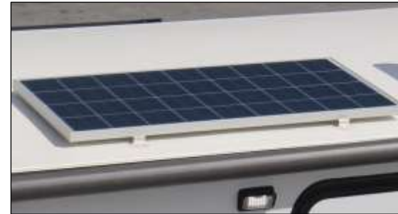
400-Watt Solar Package