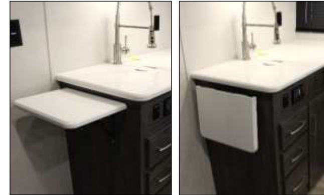
Flip-Up/Down Countertop Extension