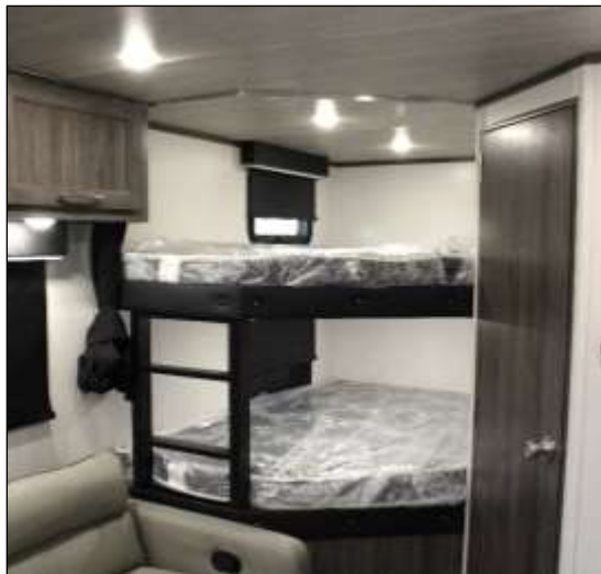
Double Bunk Beds