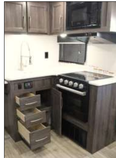
Galley Overhead & Cabinet Drawer Storage