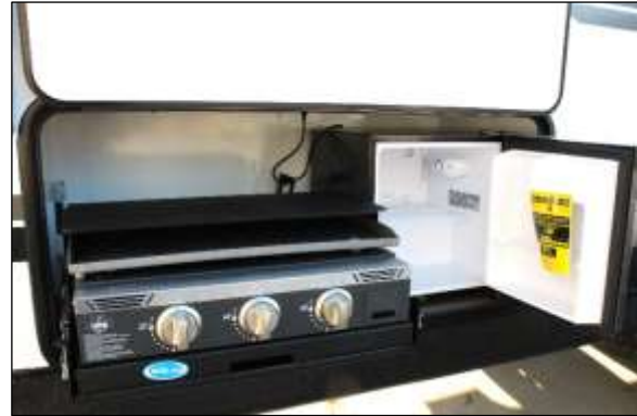
Optional Exterior Kitchen w/3-Burner Griddle & Refrigerator