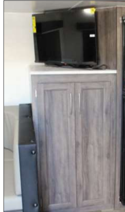
32" TV Above Pantry