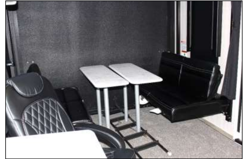
Dual Facing Dinette & Tables