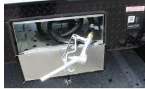
40-Gallon Fuel Station