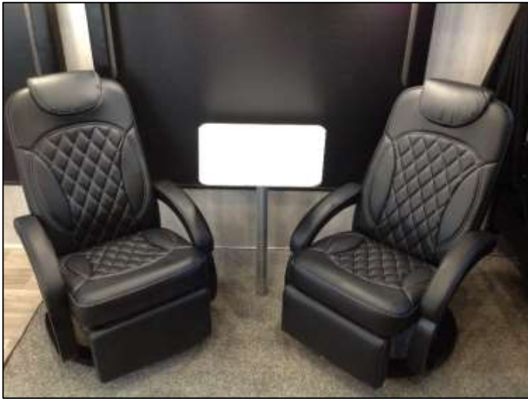
Dual Swivel Rockers w/Table