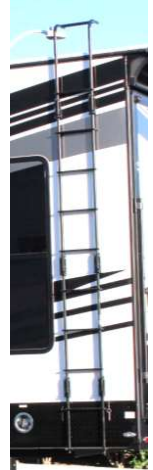
Exterior Folding Ladder & Walk-On Roof