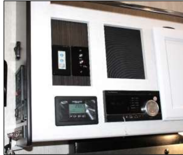
Media Control Center