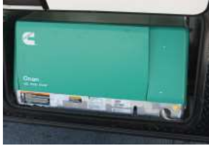
Onan 5.5KW Generator