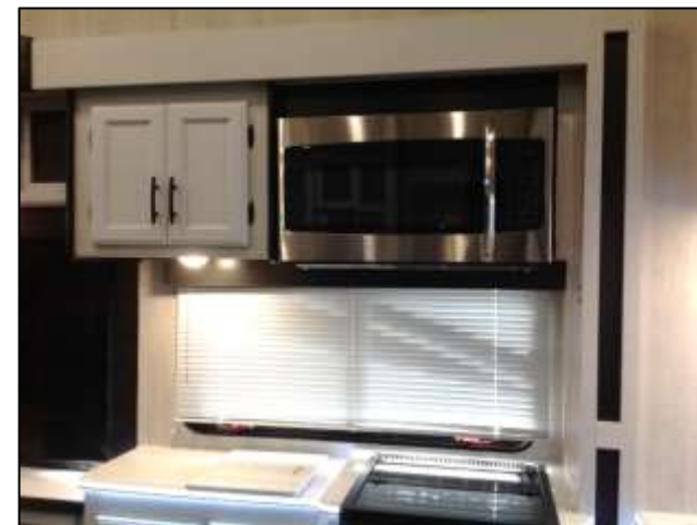
Solid Surface Counter Tops/Glass Cooktop Cover