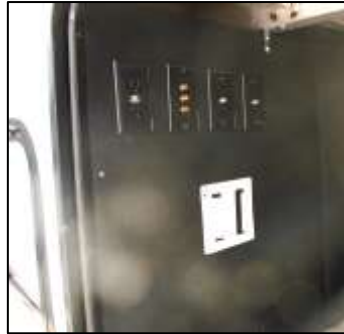
Exterior TV Hookups & Bracket