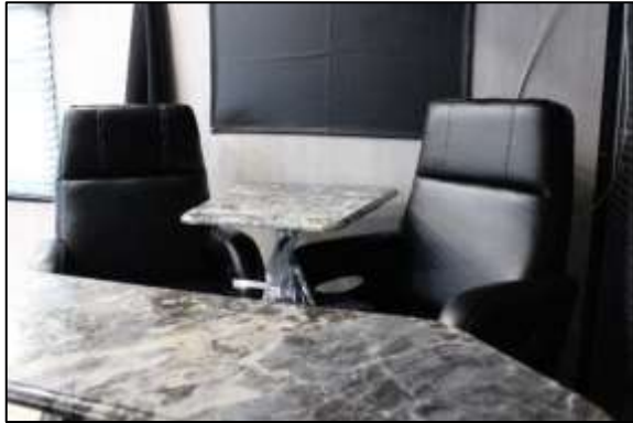
2 Swivel Rockers wTable