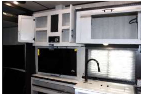
Generous Overhead Storage