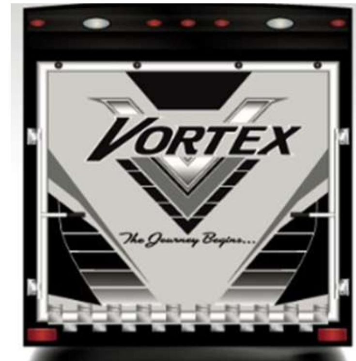
7-Foot Ramp Door