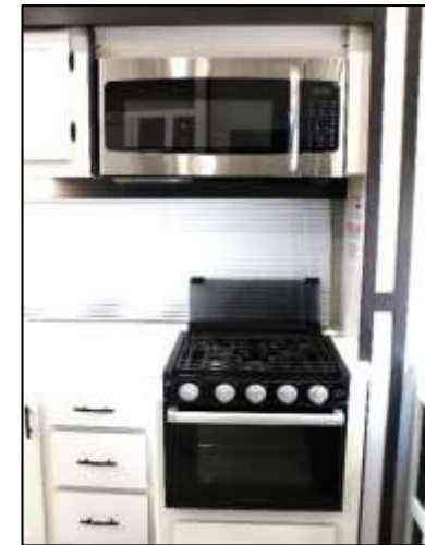
Generous Galley Storage