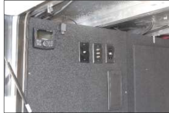
Exterior TV Hookups