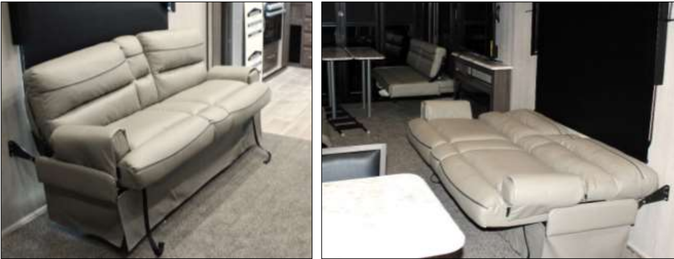
Living Room Sofa/Bed