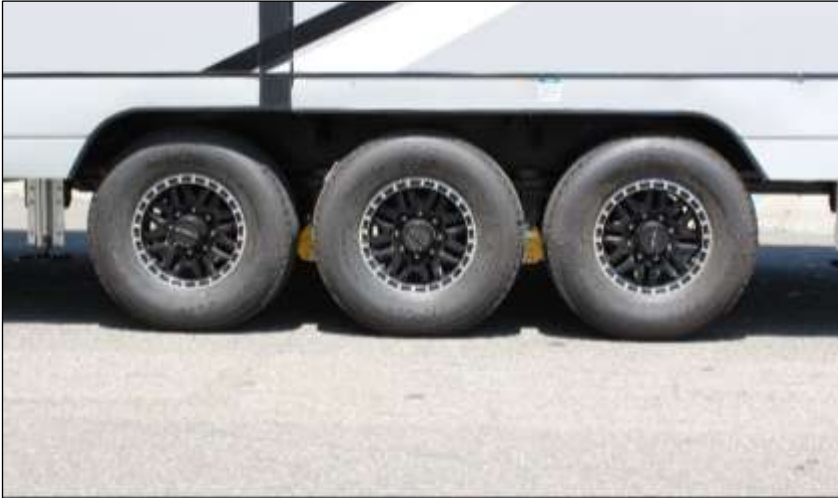
16" Deluxe Aluminum Alloy Wheels / 16" LR G Tires