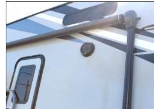
Powered Awning w/LED Strip