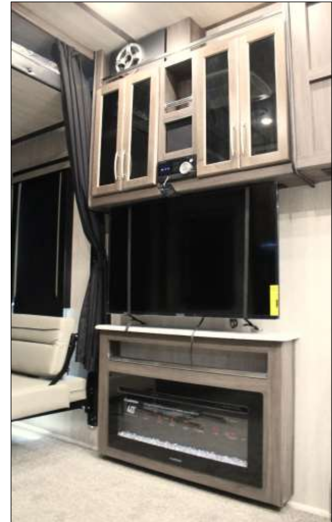
Media Center w/50" TV & 40" Electric Fireplace