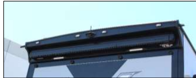
Patented Spoiler w/Wireless Backup Camera