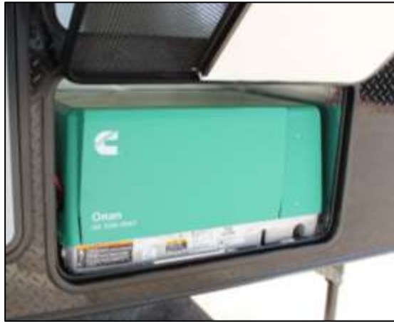
Optional Onan 5.5KW Generator