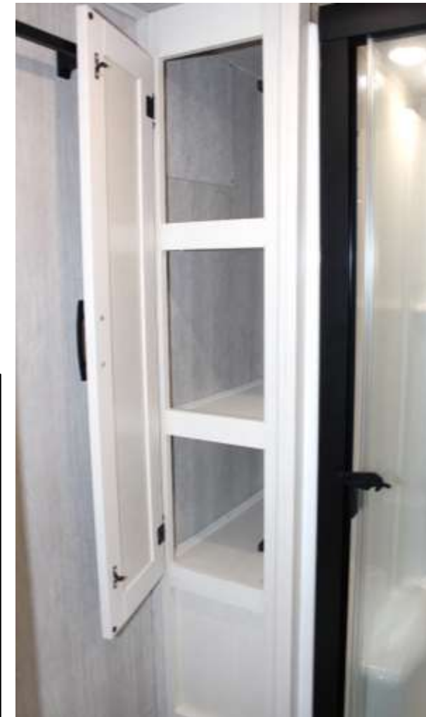
Generous Bath Storage