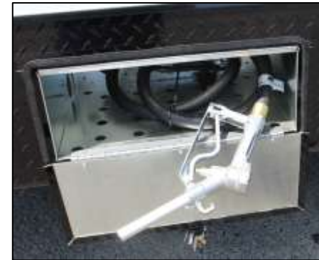
40-Gallon Fuel Station