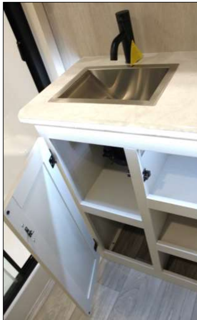
Metal Lavy Sink w/Single Handle Fixture / Mirrored Medicine Cabinet