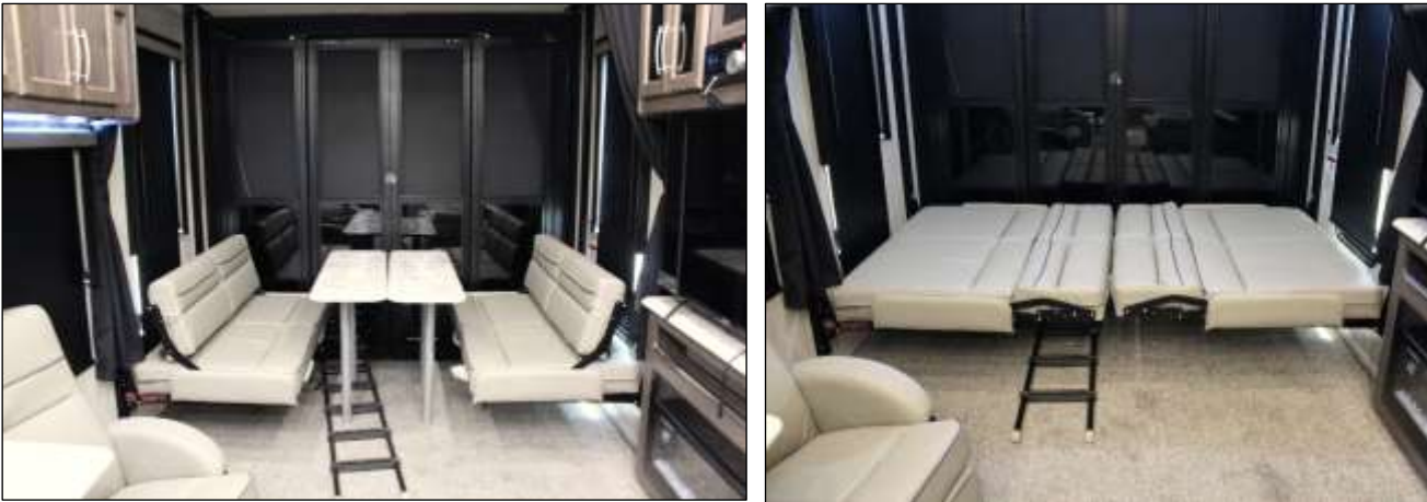
Power Opposing Dinette