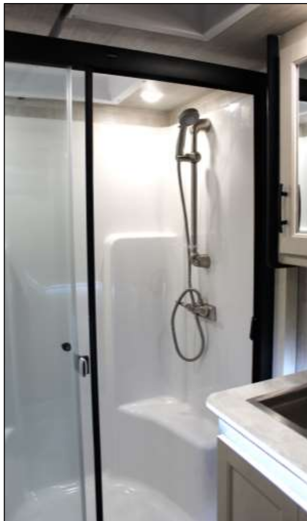
Large Shower with Skylight Above