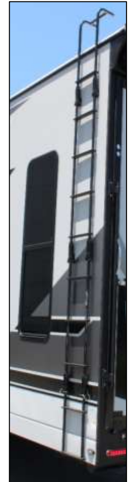
Exterior Folding Ladder & Walk-On Roof