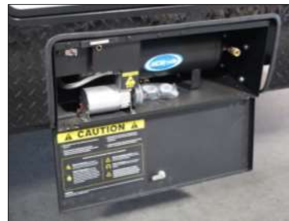
12V On-Board Air Compressor