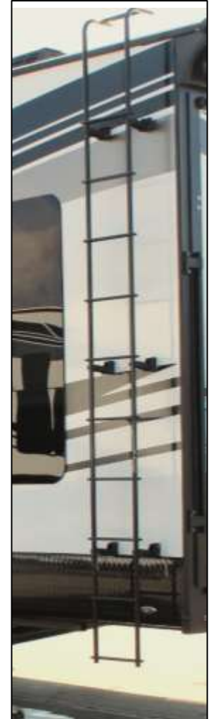
Exterior Folding Ladder & Walk-On Roof