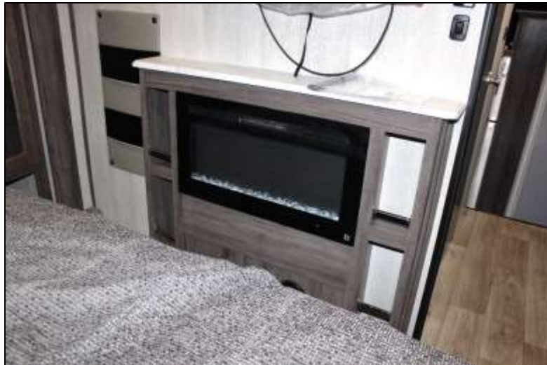
Bedroom Electric Fireplace w/Heat