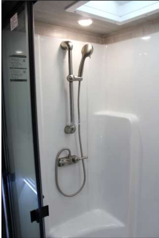
Large Shower with Skylight Above