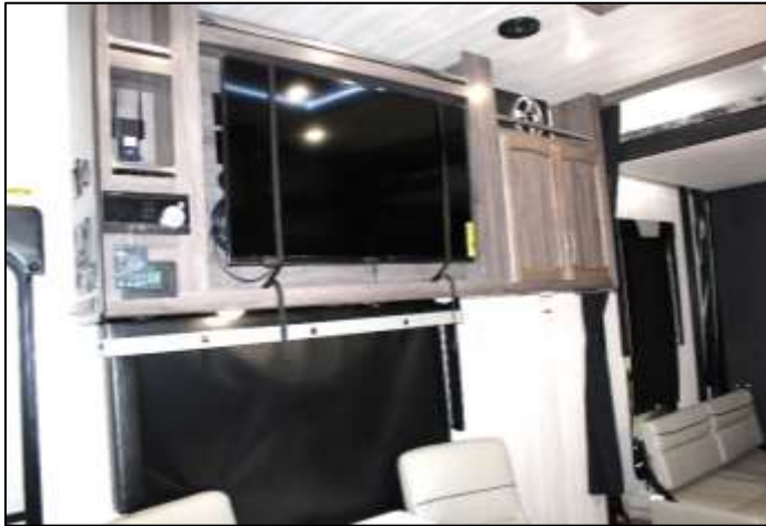
50" TV/Entertainment Center