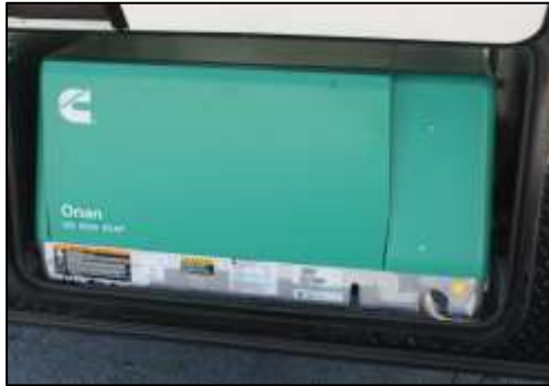
Onan 5.5KW Generator