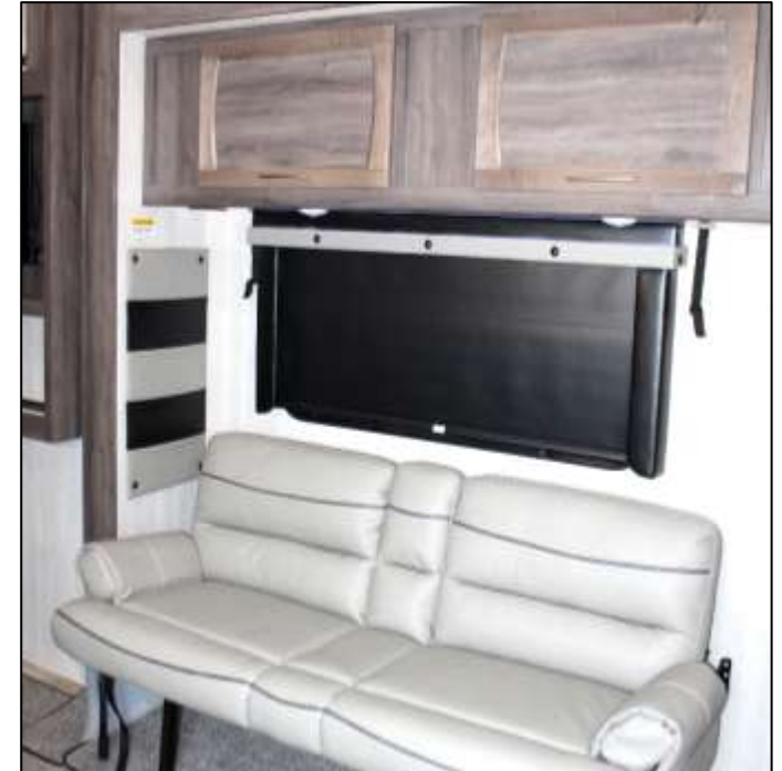
68" Slideout Sofa and Handy Magazine Rack