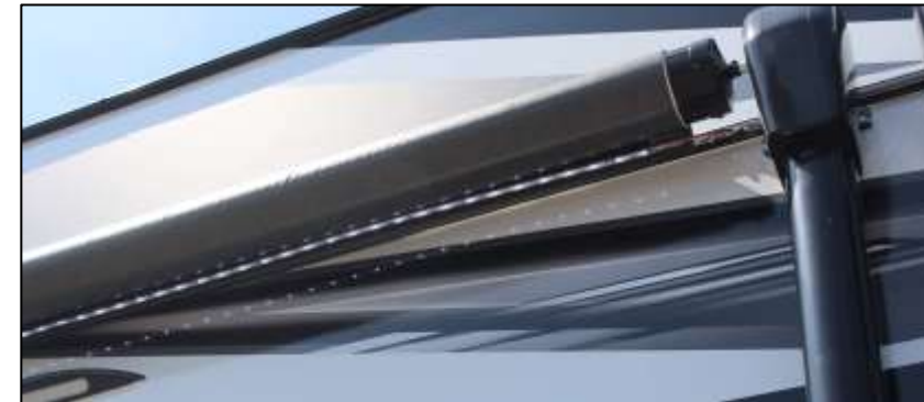
Powered Awning w/LED Strip