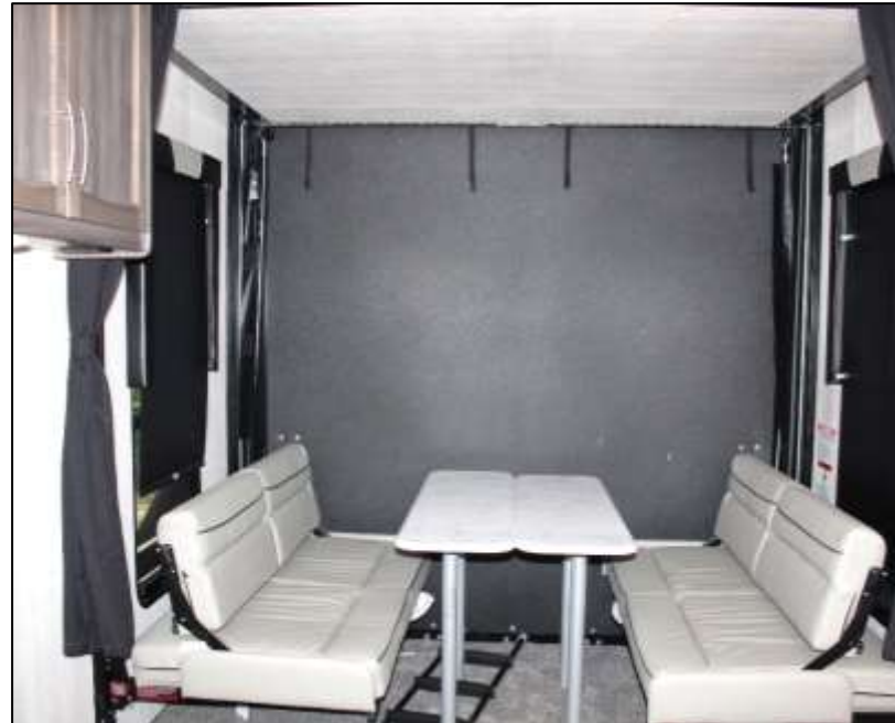
Opposing Rear Dinette