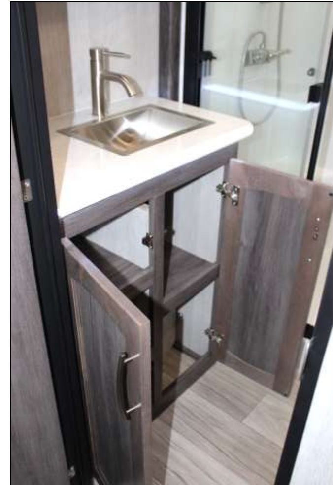
Generous Bath Storage