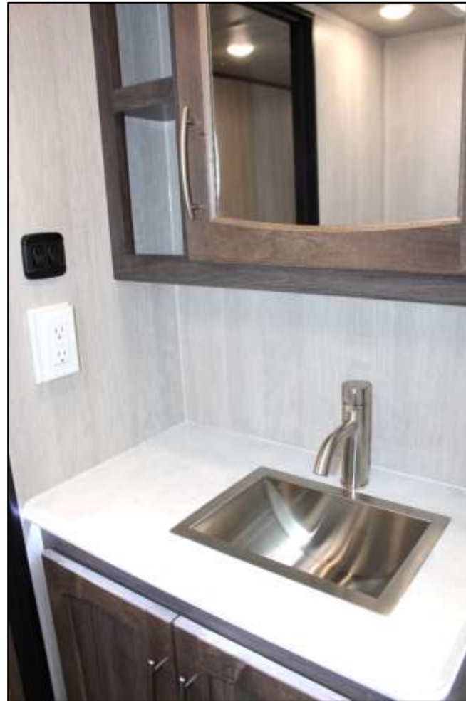
Metal Lavy Sink w/Single Handle Fixture