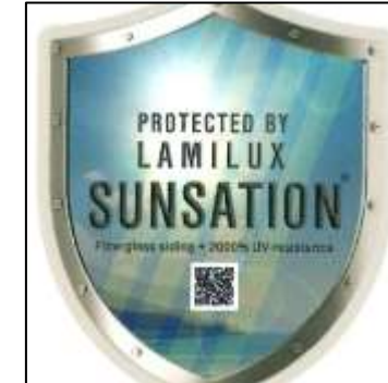
SUNSATIION ® Exterior