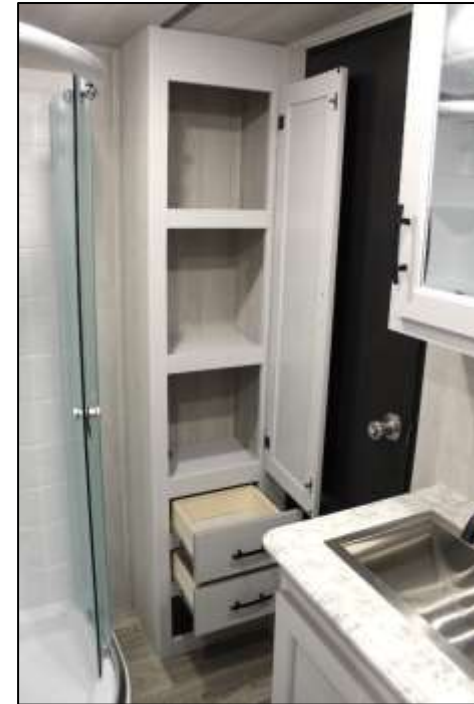
Generous Bath Storage