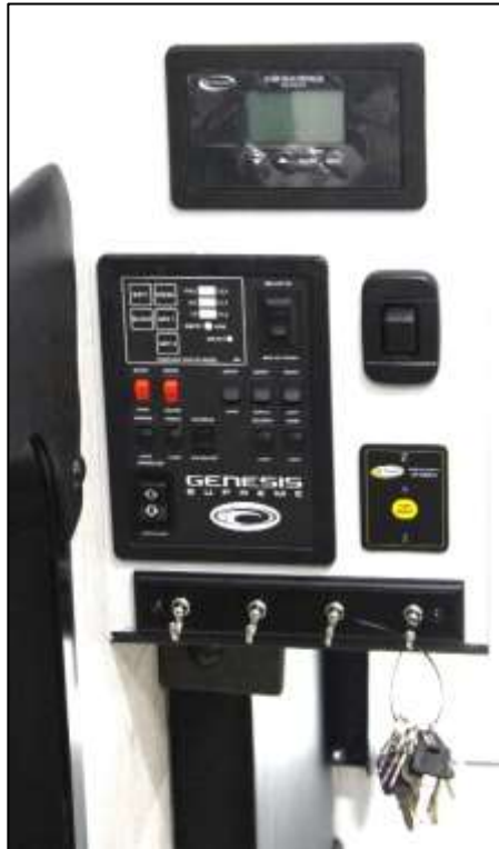
Convenient Monitor & Lighting Control Center