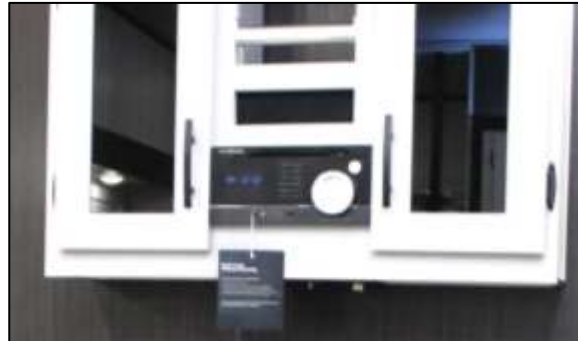
Audio/Video/Media Control Center