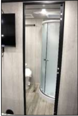
Bedroom to Lavy Private Access