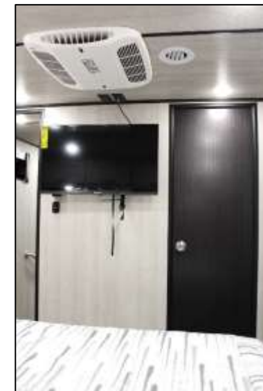
Optional 32" Bedroom TV