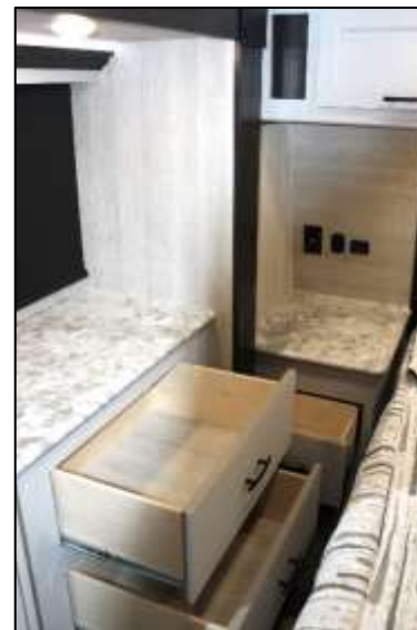
Large, High-Capacity Drawers