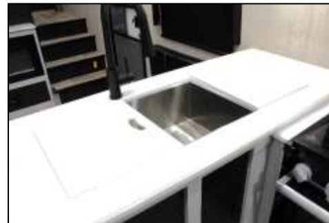
Easy to Maintain Solid Surface Countertops and Metal Fixtures