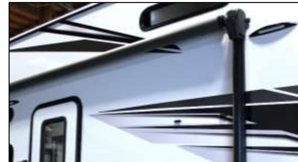
Powered Awning w/LED Strip