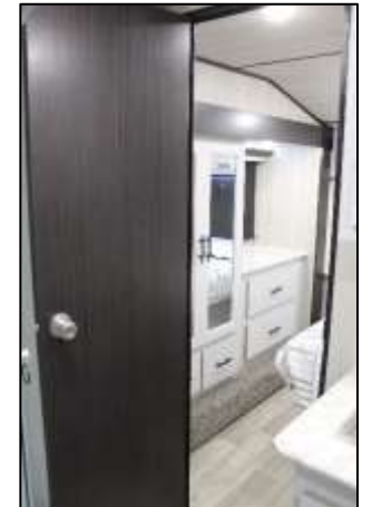
Lavy to Bedroom Private Access