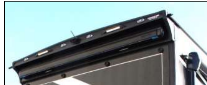
Patented Spoiler w/Rear Camera