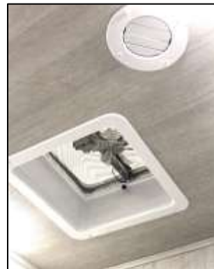
12V Powered Overhead Vent