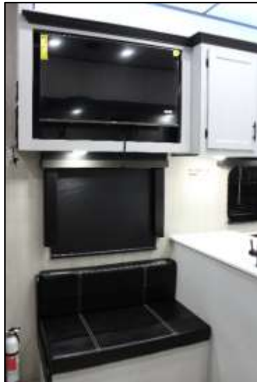
40" TV/Dinette Seating