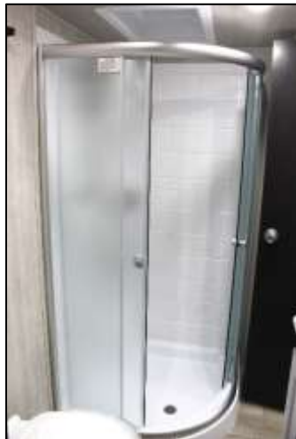
Curved Glass Shower Door