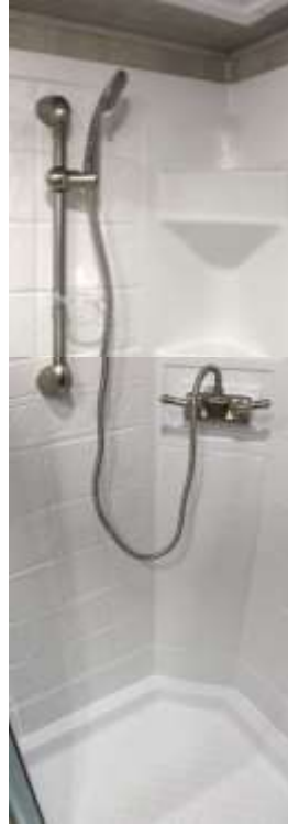
Large Shower with Skylight Above