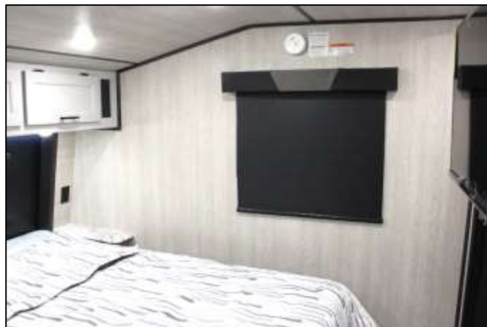
Black Roller Window Shades Throughout