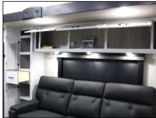
Abundant Overhead Storage