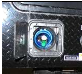
Water Hose Sprayer