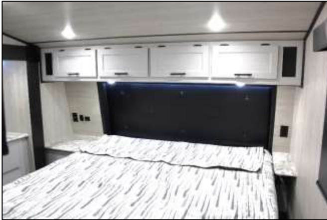
King Memory Foam Mattress/Coordinated Bedspread