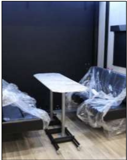
Power Opposing Dinette