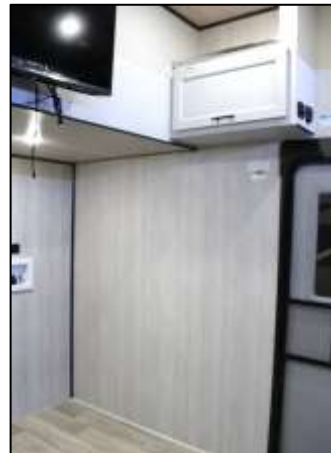
Large Overhead Storage Area