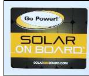
200W Solar Panels