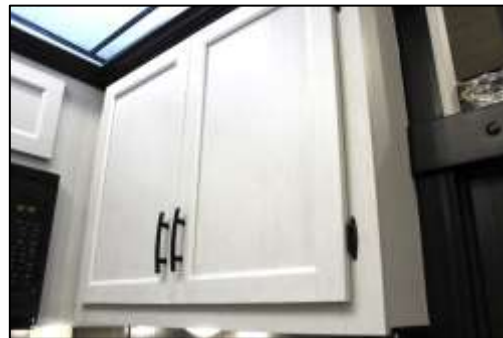
Durable, Designer Cabinet Finishes