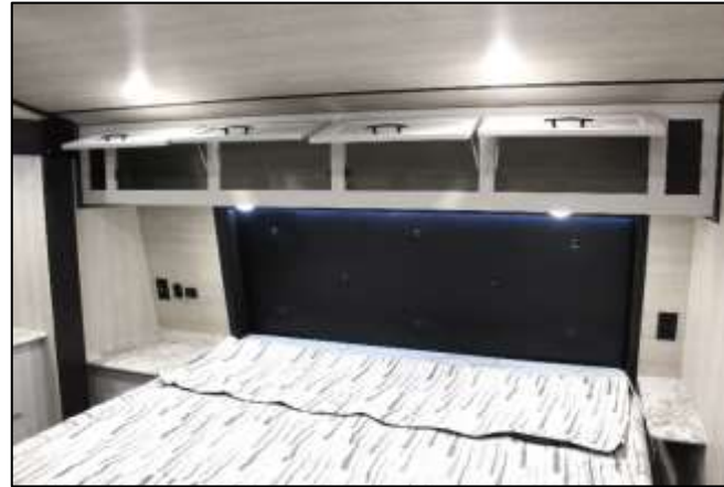
Generous Overhead Storage