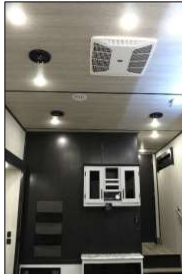
Decorative & Functional Overhead Lighting