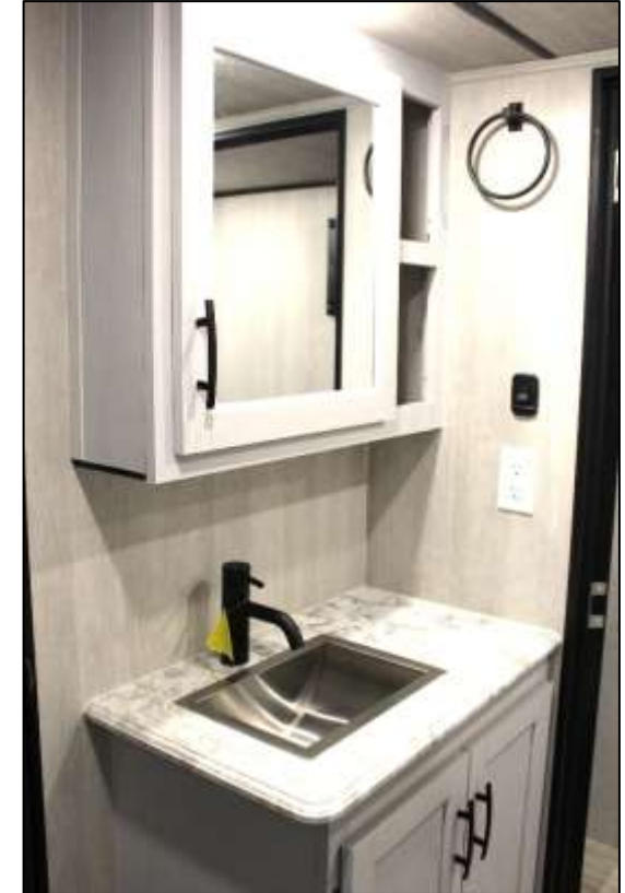
Metal Lavy Sink w/Single Handle Fixture