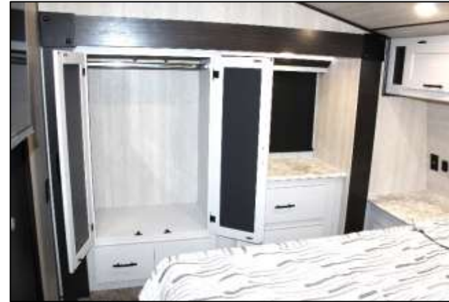
Wardrobe/Vanity in Slideout