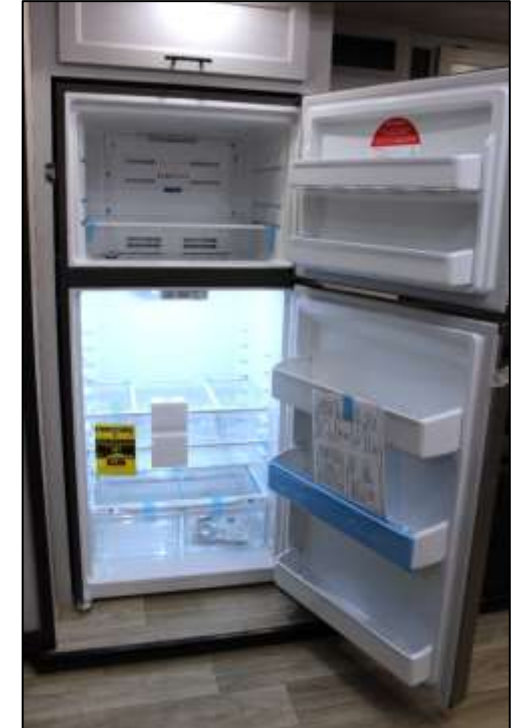
Large Residential Stainless Refer