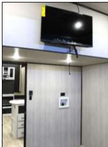
32" TV on Swivel Bracket