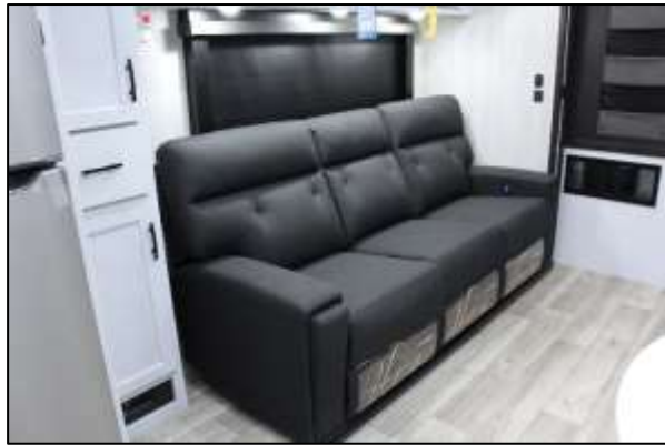
Luxurious Electric Recliner Sofa