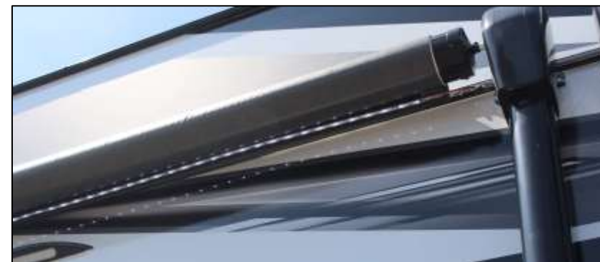
Powered Awning w/LED Strip