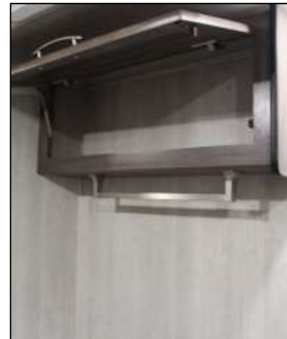
Generous Bath Storage