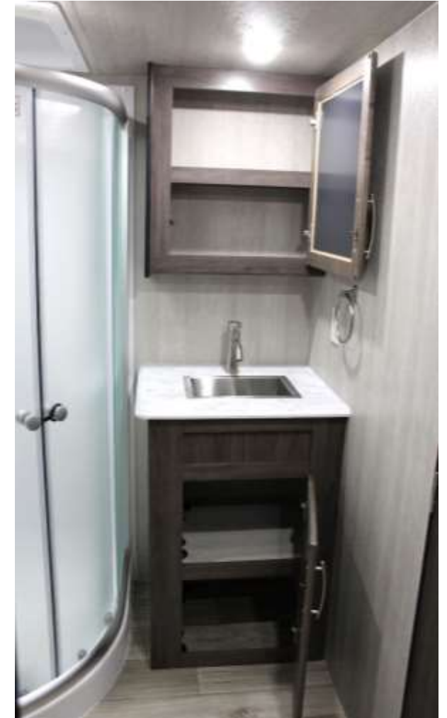
Medicine Cabinet, Under-Sink Storage