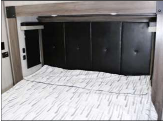
King Bed In Slideout