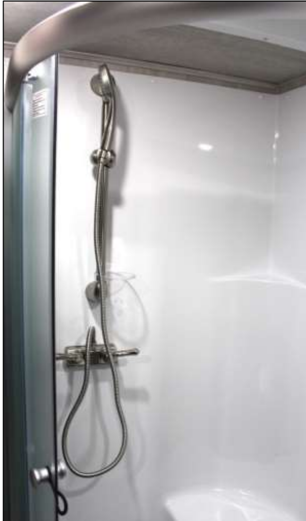
Large Shower with Curved Glass Door & Skylight Above