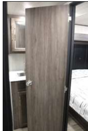
Private Lavy Access