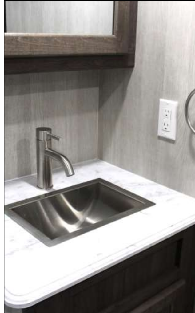
Metal Lavy Sink w/Single Handle Fixture