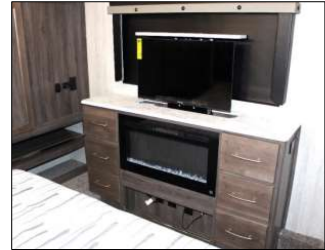
32" HideAway TV / 30" Fireplace