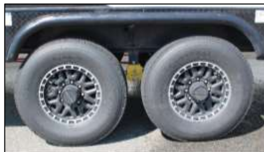
16" Aluminum Alloy Wheels