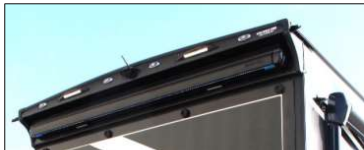
Patented Spoiler w/Rear Camera