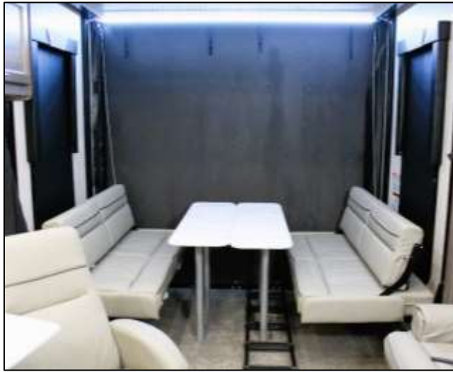
Opposing Rear Dinette