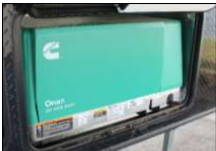
Optional Onan 5.5KW Generator