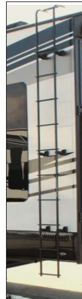
Exterior Folding Ladder & Walk-On Roof