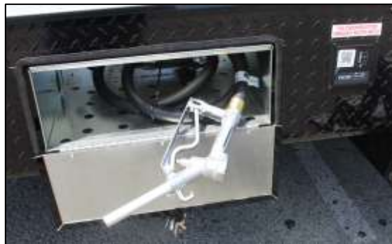
40-Gallon Fuel Station