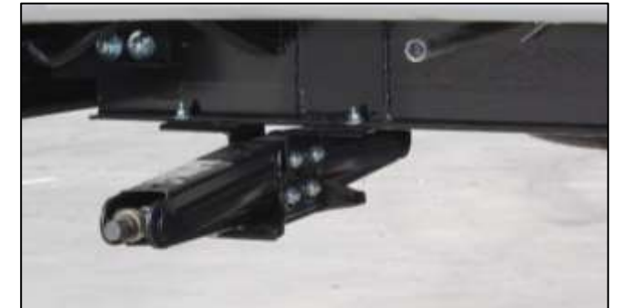
Stab Jacks (Exterior Premier Package)