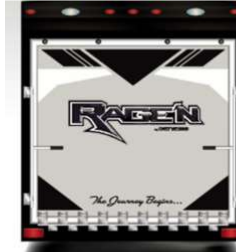
7-Foot Ramp Door