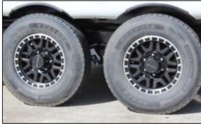
15" Aluminum Wheels/Load Range E Tires