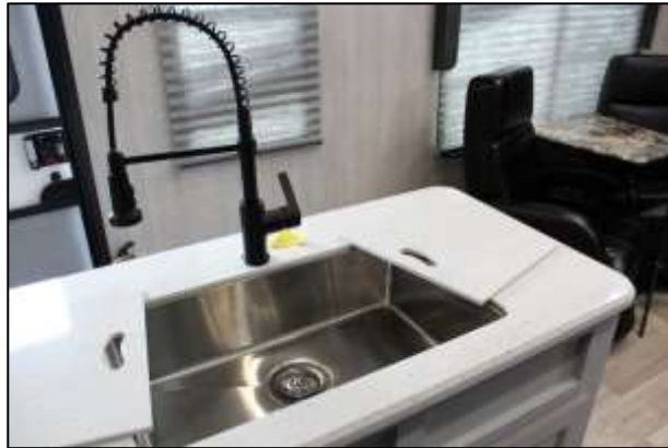
Stainless Galley Sink & Pullout Faucet