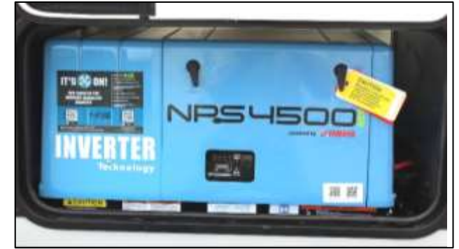
Yamaha 4.5K Generator