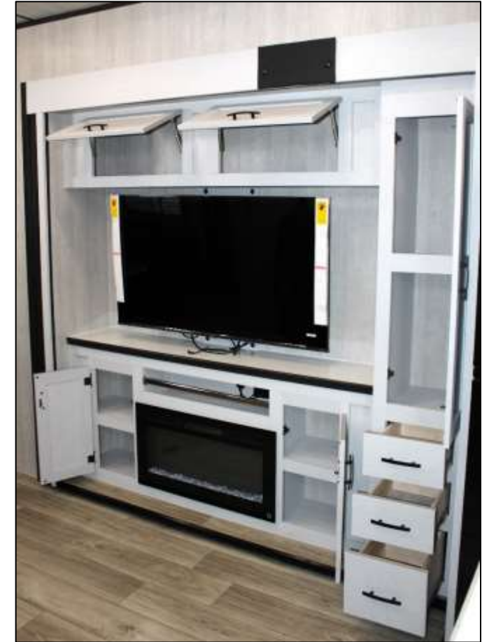
Entertainment Center TV & Fireplace