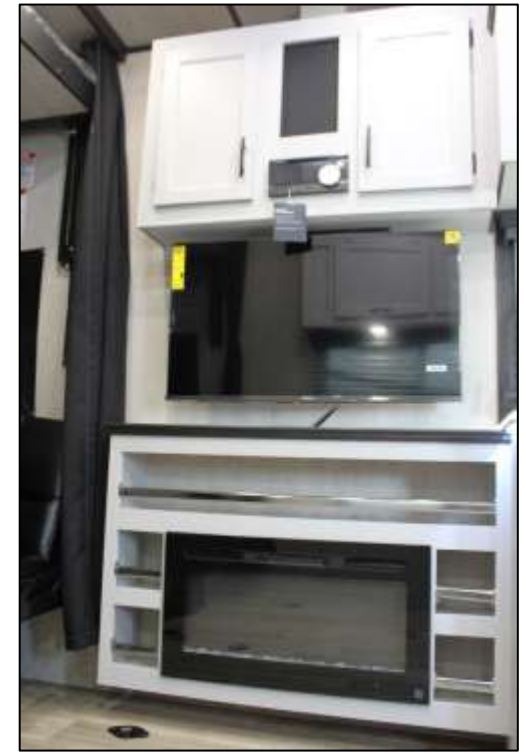
40" TV / Entertainment Center w/Fireplace