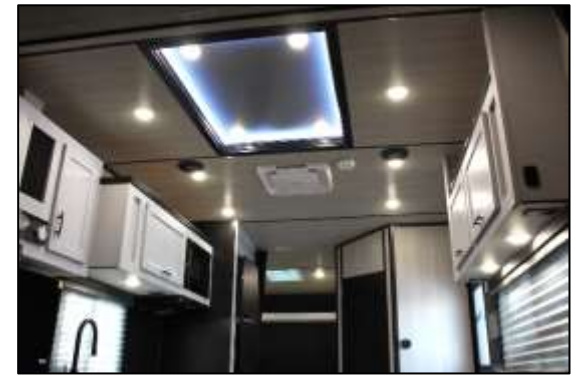
Deluxe Accent Lights w/Soffit