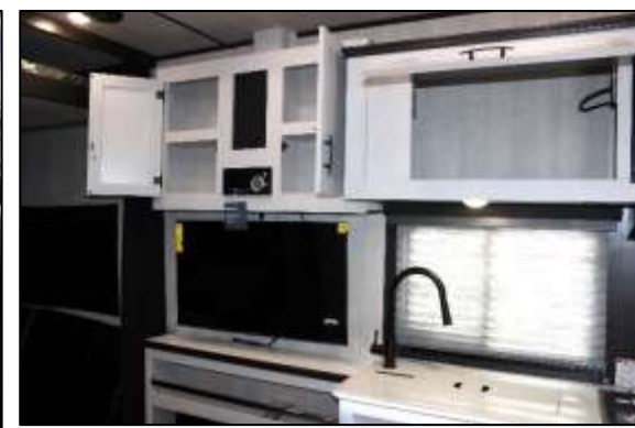
Generous Overhead Storage