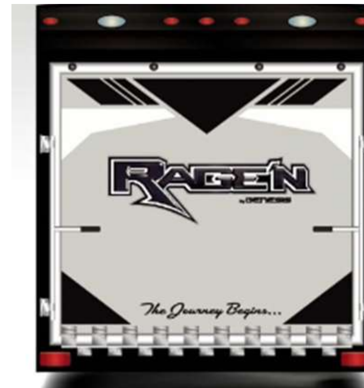
7-Foot Ramp Door