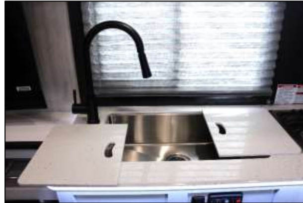
Stainless Galley Sink / Pullout Faucet / Sink Covers