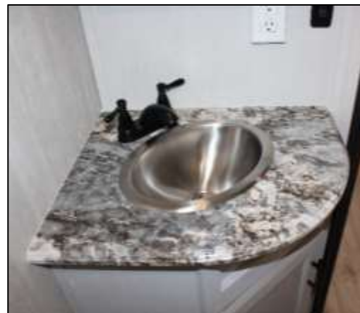
Lavy Sink w/Medicine Cabinet