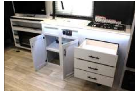
Generous Galley Storage