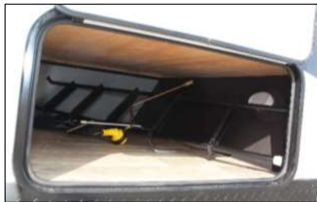
Front Storage Compartment