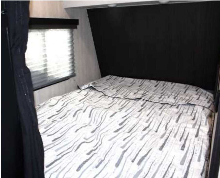
54 X 74 Full Bed w/Bedsread & Privacy Curtain