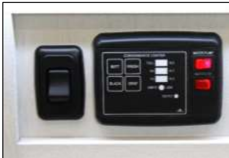
Centralized Monitor/Control Center