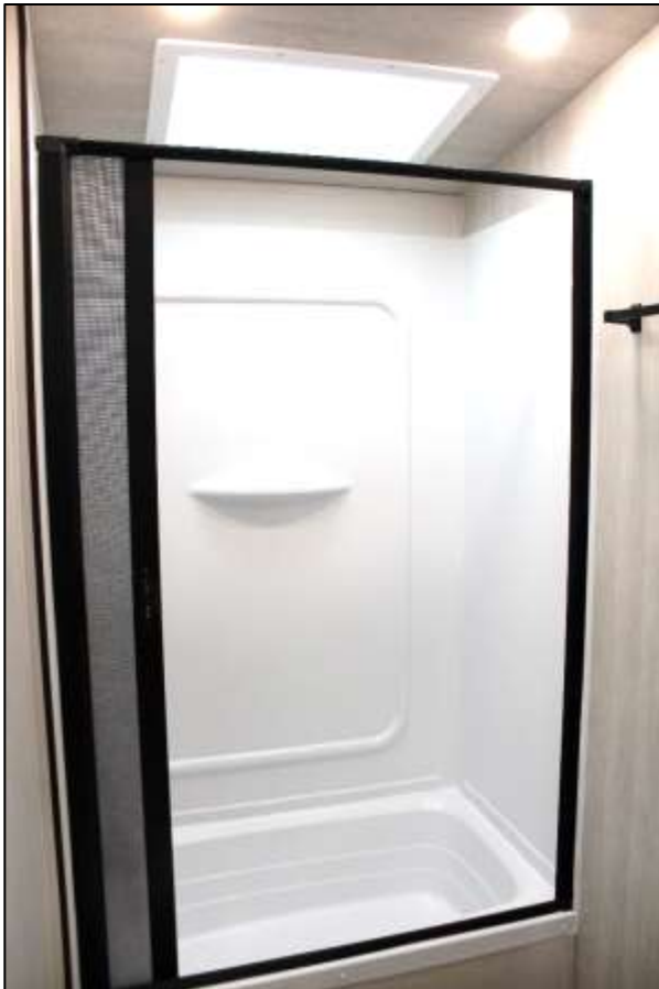
Shower w/ Retractable Door