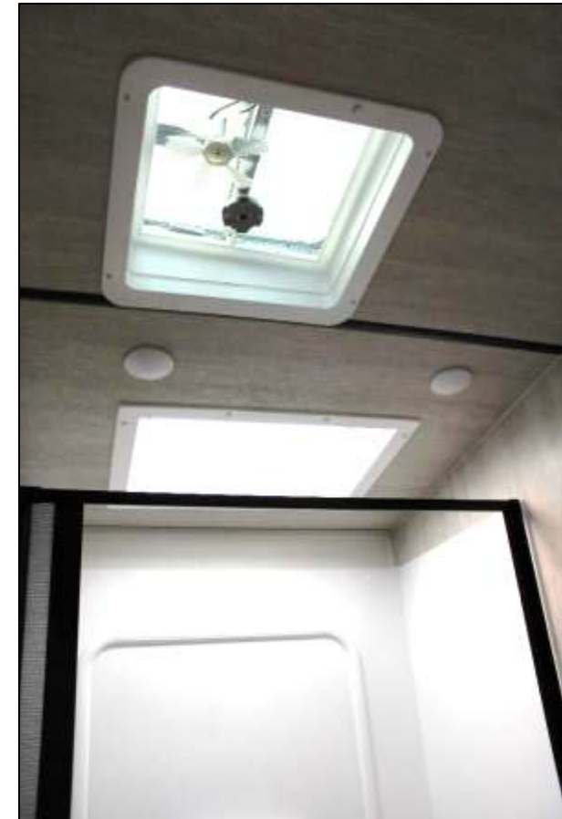
12-Volt Powered Lavy Vent Fan & Skylight Above Shower