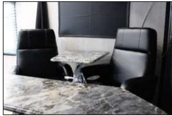
2 Swivel Rockers wTable