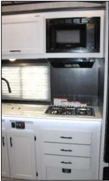
Efficient Meal Prep w/OH Microwave