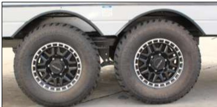
Optional Aluminum Wheels