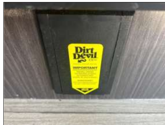
Central Vacuum System