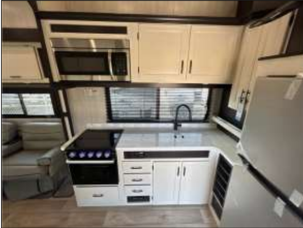
Solid-Surface Countertops & Sink Covers