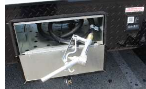
40-Gallon Fuel Station