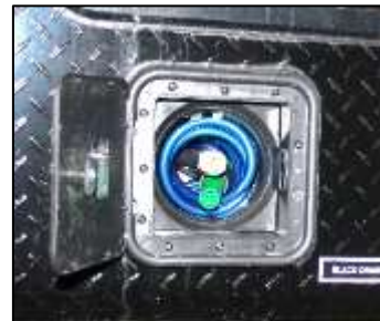
Water Hose Sprayer