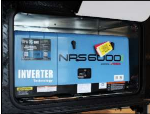
Optional Yamaha 6.0KW Inverter/Generator