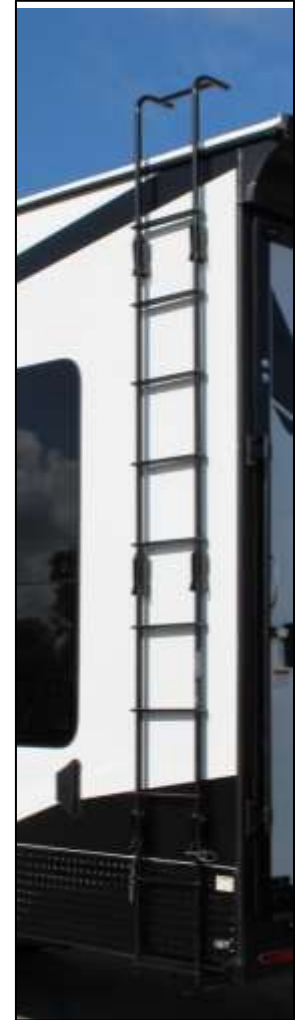
Exterior Folding Ladder & Walk-On Roof