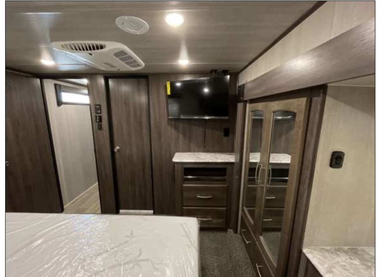
Bedroom Entertainment Center / Duo Wardrobe & Vanity