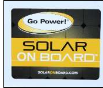
200W Solar Panels