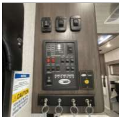
Convenient Monitor & Lighting Control Center