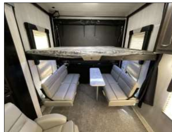
Power Opposing Dinette