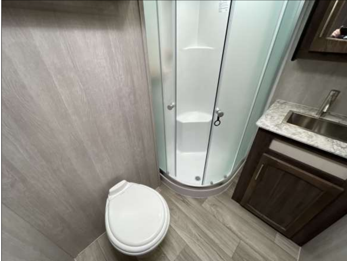
Premium Designer Fixtures & Solid Surface Cabinet Top