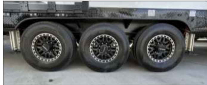
16" Wheels/LR G Tires