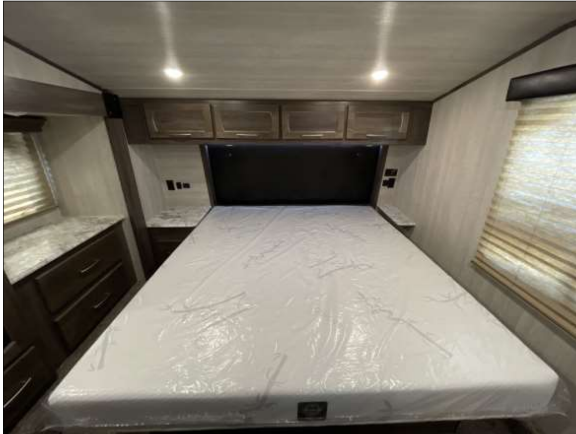
Wardrobe/Vanity in Doorside Slideout