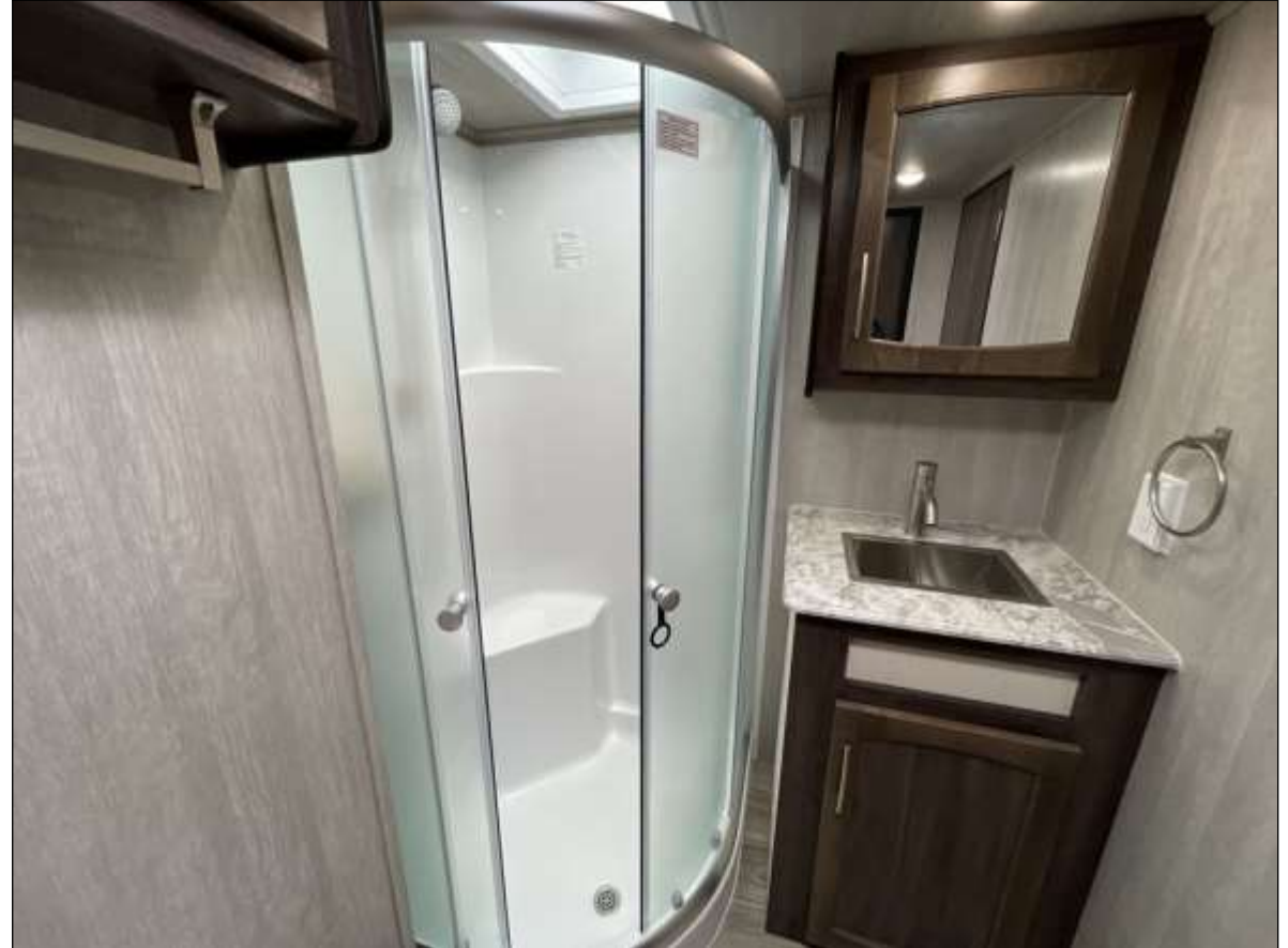
Large Fiberglass Shower w/Glass Door & Skylight Above