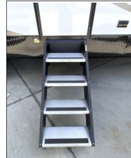
"Step-Above" Entry Steps