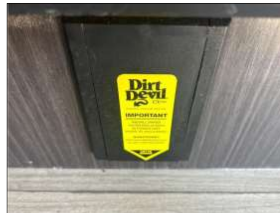
Central Vacuum System