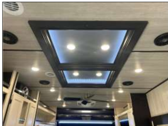
Accent & Overhead Lighting