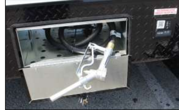
40-Gallon Fuel Station