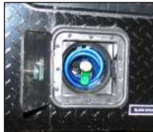
Water Hose Sprayer