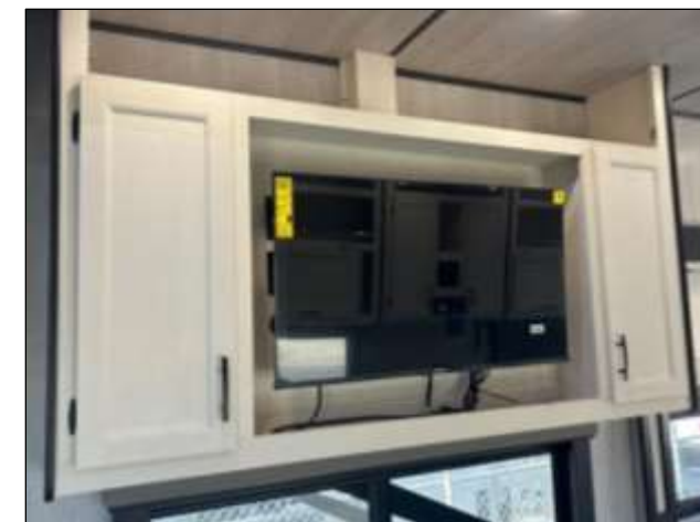
Living Room TV & Media Storage