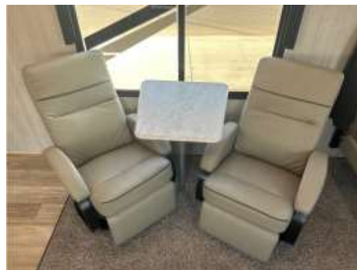
Dual Swivel Rockers w/Table