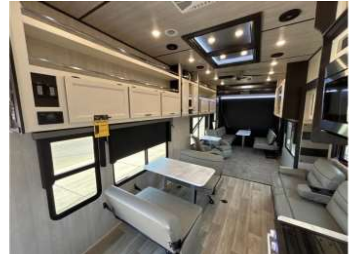
Spacious, Open Floor Plan with Abundant Overhead Storage