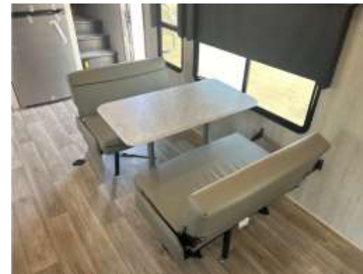
Side Opposing Dinette