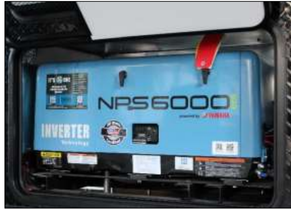
Yamaha 6.0KW Inverter Generator