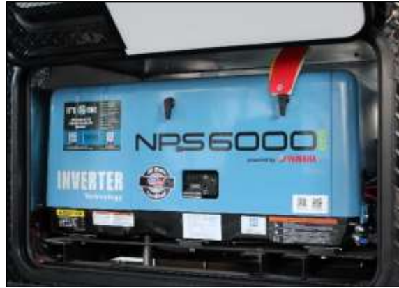
Yamaha 6.0KW Inverter Generator