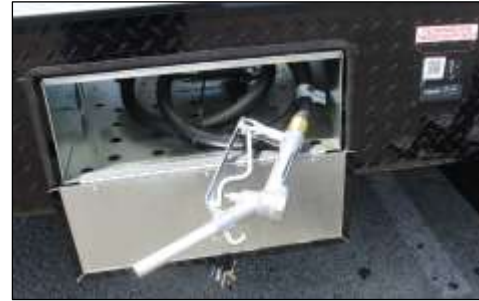
40-Gallon Fuel Station