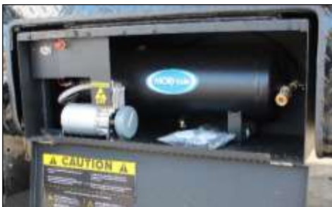
12V On-Board Air Compressor