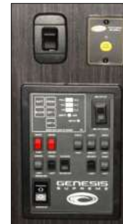
Centralized Monitor, Lighting & Inverter Controls