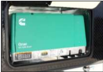
Optional Onan 5.5KW Generator