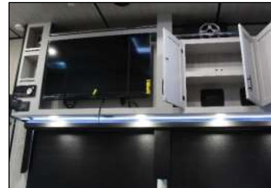
50" Living Room TV w/Overhead Storage