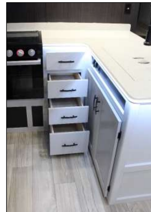
Solid Surface Countertops