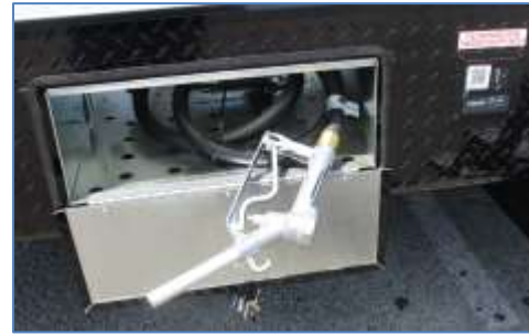
40-Gallon Fuel Station