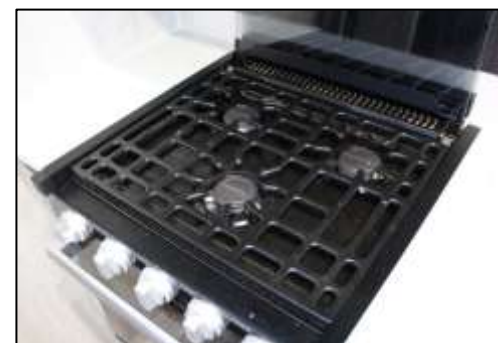
3-Burner Glass Top Range w/Oven