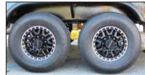
16" Deluxe Aluminum Alloy Wheels