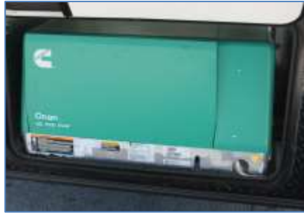
Optional Onan 5.5KW Generator