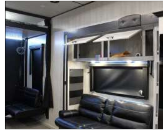
Generous Slideout Overhead Storage