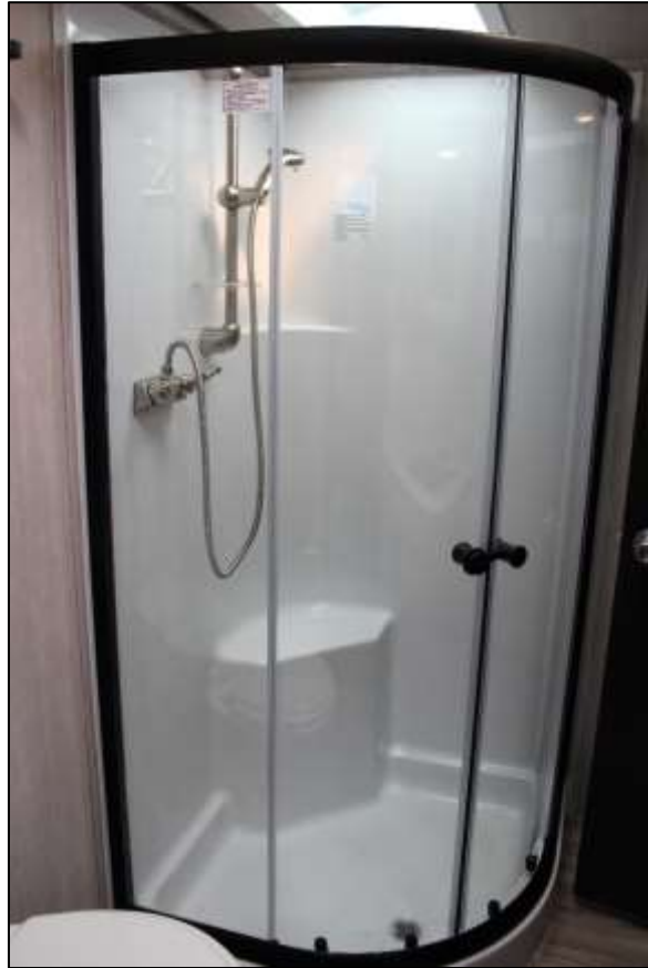
Fiberglass Shower w/Glass Door & Overhead Skylight