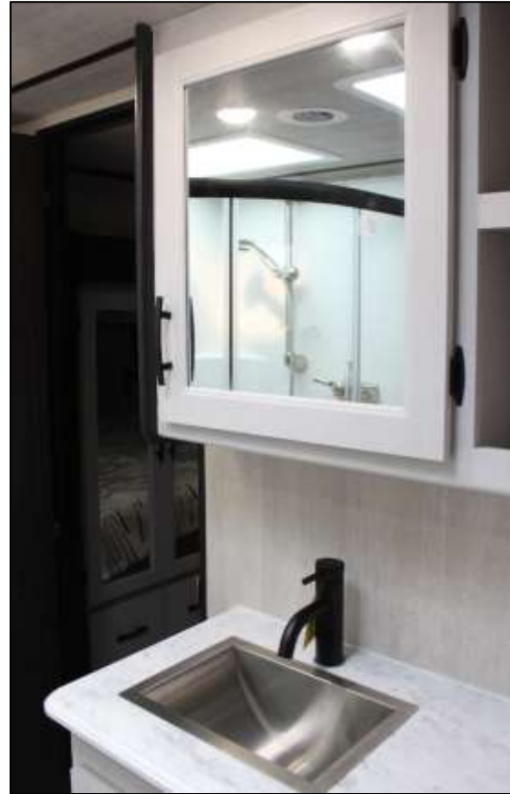
Stainless Sink/Designer Fixtures/Mirrored Medicine Cabinet