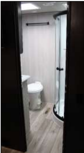
Private Lavy Access