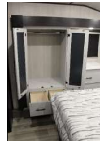
Overhead & Deep Drawer/Wardrobe Storage