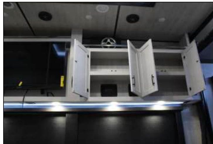
Generous Overhead Storage