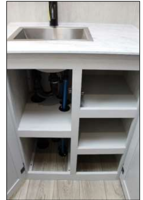
Generous Shower/Lavy Storage