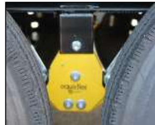
Optional Equa-Flex® Suspension