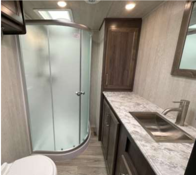
Fiberglass Shower w/Glass Door, Overhead Skylight & Designer Fixtures