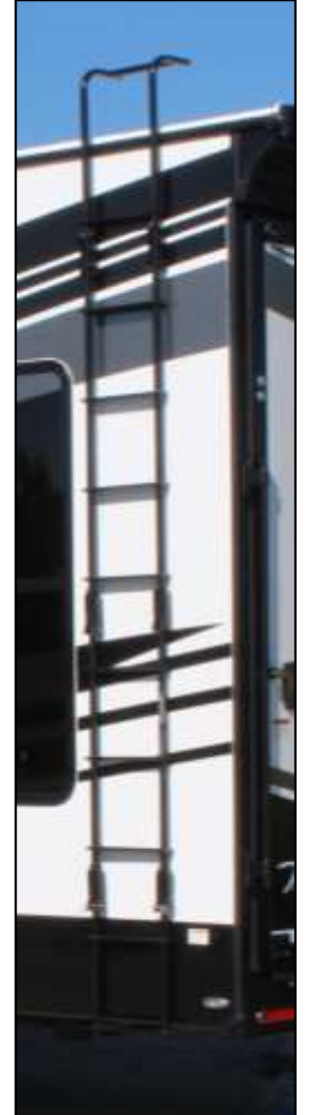
Exterior Folding Ladder & Walk-On Roof