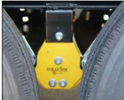
Optional Equa-Flex® Suspension