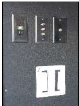
Exterior TV Hookups & Bracket