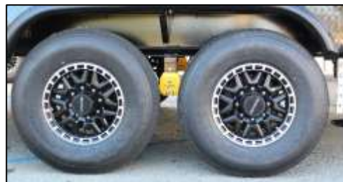
16" Deluxe Aluminum Alloy Wheels