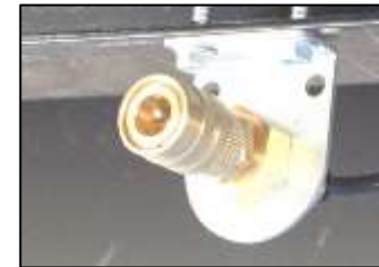
On-Board Air Quick Connect