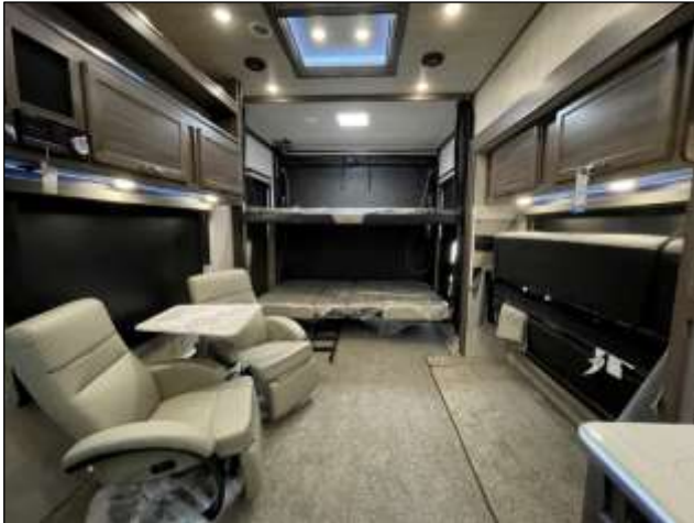
Practical Overhead & Accent Lighting