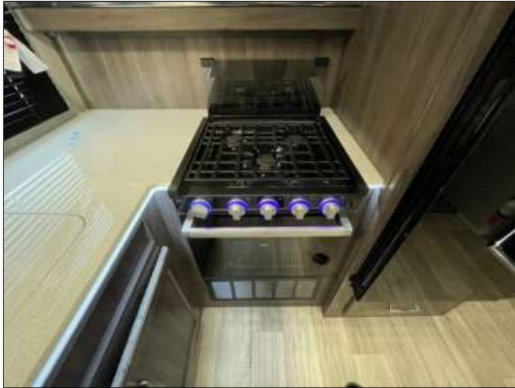
3-Burner Glass Top Range w/Oven