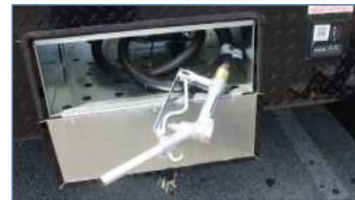
Optional 40-Gallon Fuel Station