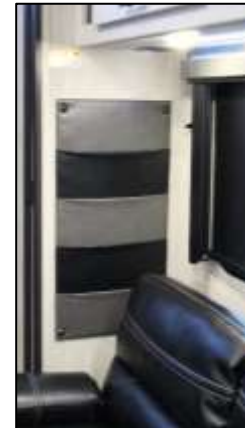
Slideout Magazine Rack