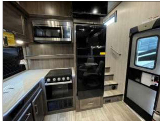
Efficient Meal Prep Center