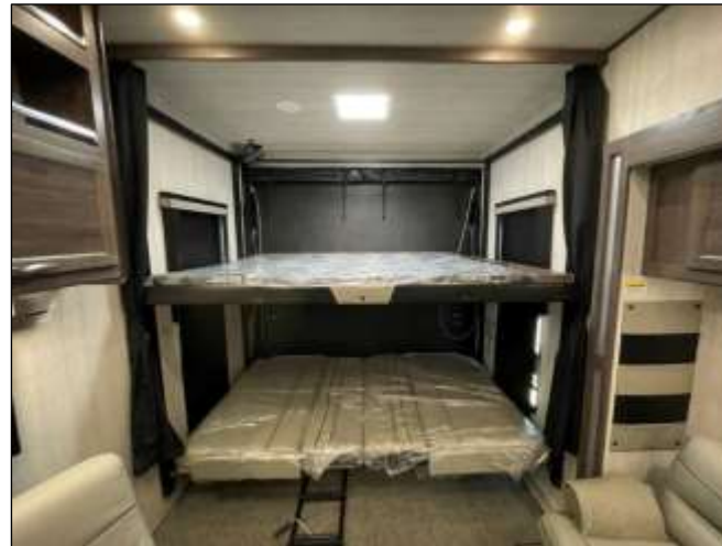
Opposing Rear Dinette/Power Upper Bunk (Shown converted into bed)