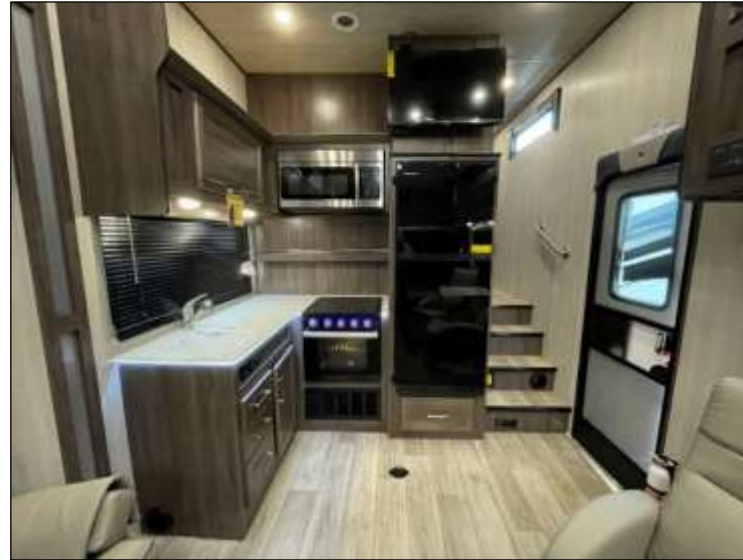
Spacious, Open Floorplan