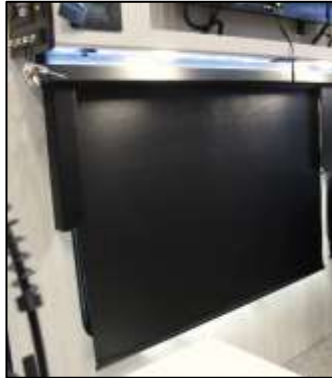
Black Roller Shades Throughout