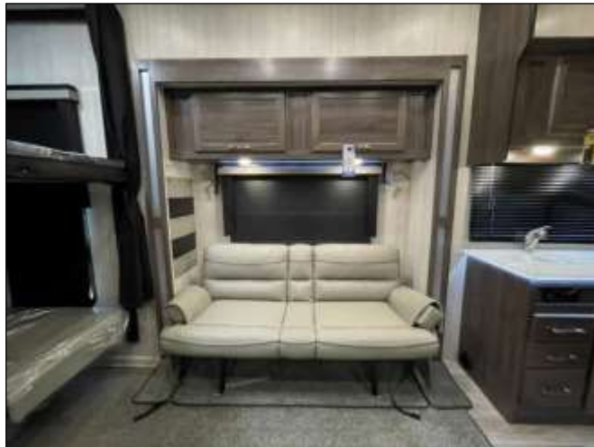
Slideout Sofa/Magazine Rack Slideout Overhead Storage