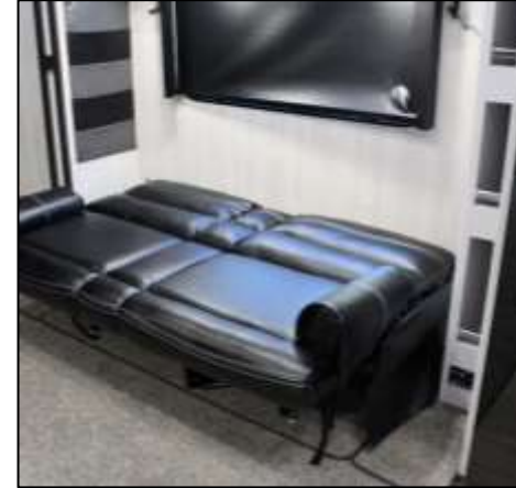
Slideout Sofa Bed