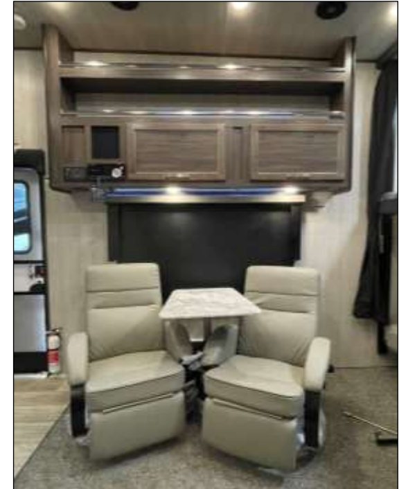
Two Swivel/Rockers w/Table