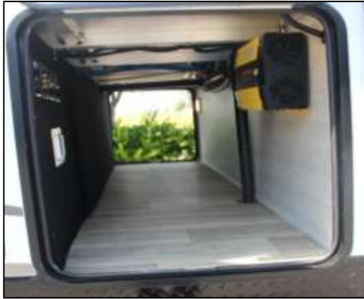
Pass-Thru Front Storage