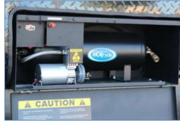
Optional On-Board Air Compressor