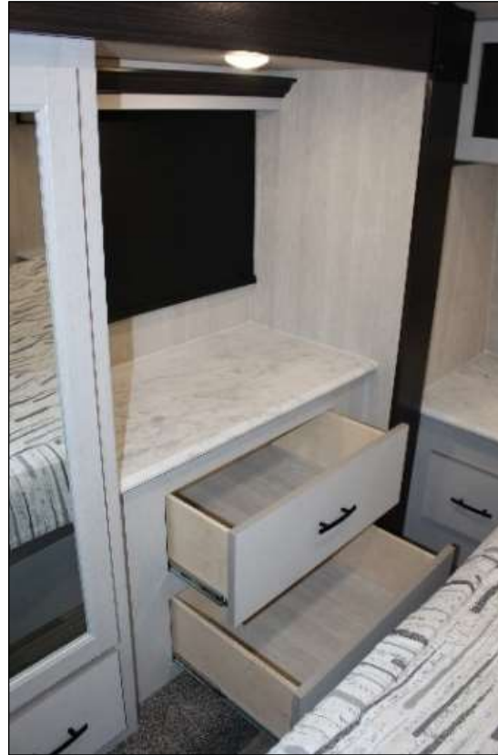
Deep Drawer/Wardrobe Storage