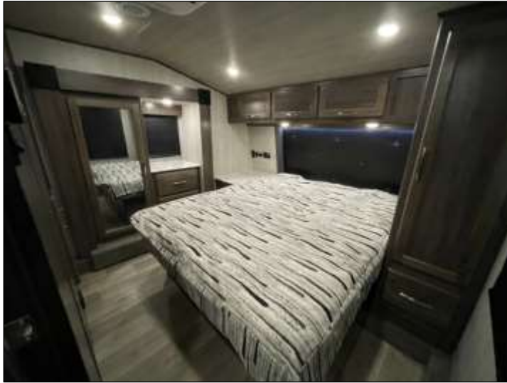
Walk-Around King Bed