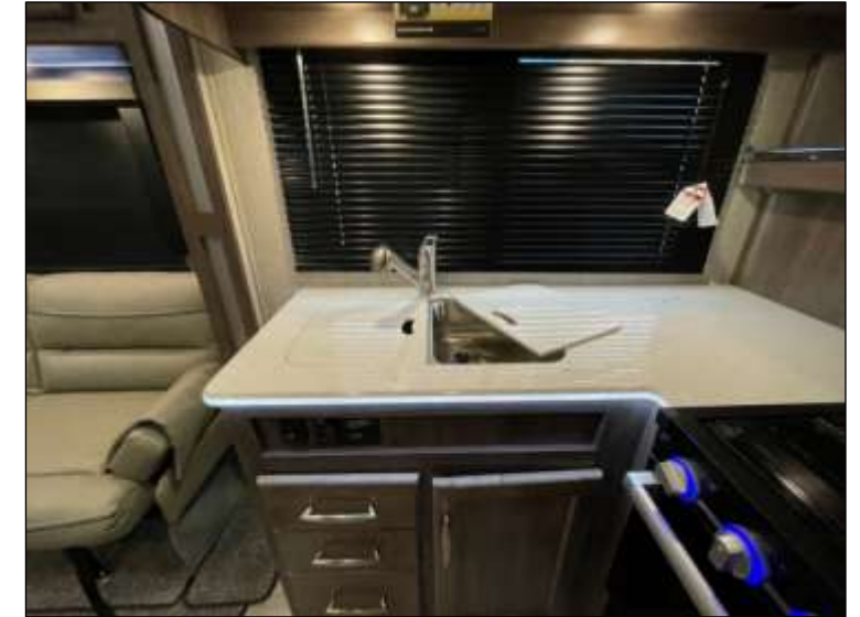
Solid Surface Countertops/Sink Covers Deep Stainless Sink w/Single Handle Faucet