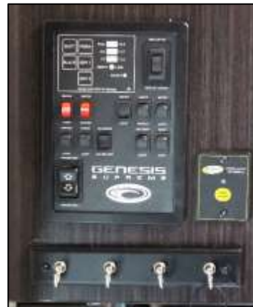
Central Monitor/Control Panel