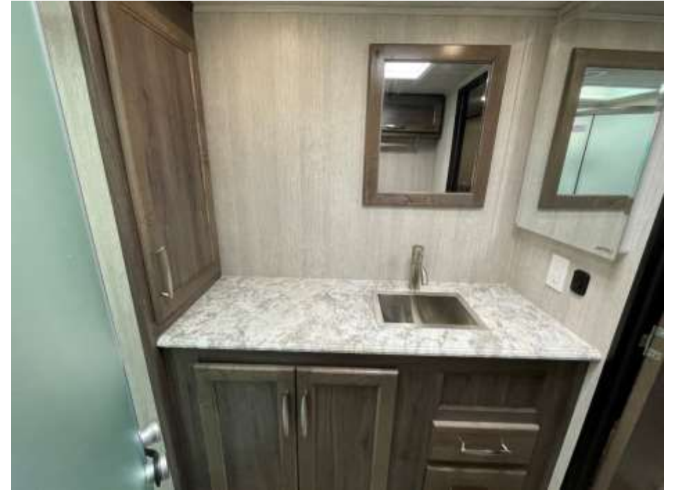
Stainless Sink/Designer Fixtures/Mirrored Medicine Cabinet Generous Shower/Lavy Storage