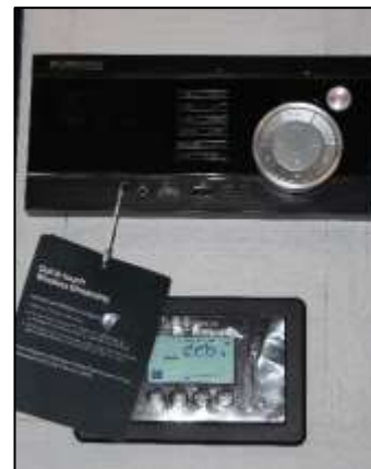
Media Control Center